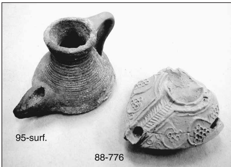
Late Byzantine (left) and Abbasid (right) lamps. Aqaba, Jordan

The Geniza signifies the vast collections of medieval documents known from the Ben Ezra synagogue in Cairo. These testify to the activities of the merchants of Fustat (medieval Cairo), who traveled to the Red Sea and ventured on to India. They mingled with communities in Arabia and the Levant and used Ayla (Aqaba) as one of their principal ports leading to these eastern lands. Beginning in Fustat/Cairo, merchants and pilgrims crossed the Sinai (known