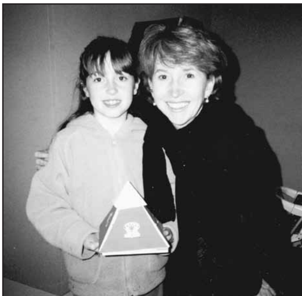
Mother and daughter proudly display the unique, pyramid-shaped "book-in-a-box" they made at our spring family workshop co-sponsored by the Frank Lloyd Wright Preservation Trust.