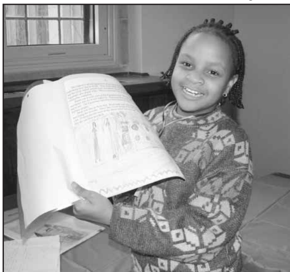
Student from Brownell School shows the report she created as part of the museum and classroom study of Egypt her teacher developed during Oriental Institute/CPS seminar for educators.

Along with its relationship to the Chicago Public Schools, our seminar program this past year became more closely associated with the Illinois State Board of Educa-