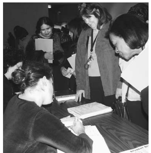
Teachers are fascinated to see their names written in cuneiform script during an Educators' Open House for the new Mesopotamian Gallery.