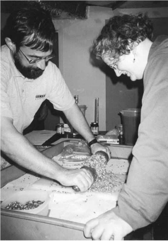
Crushing grain was a key step in the process for "Brewing Ancient Beer," a course where students created — and then sampled! — their own versions of an ancient Sumerian libation.