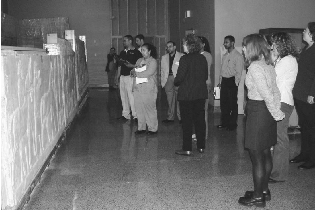
Teachers and administrators from the Chicago Public Schools (CPS) join docents and Education staff to preview the Assyrian reliefs being installed in the Oriental Institute's East Wing. These CPS educators are our advisory panel for "Ancient Mesopotamia Online," a two-year educational initiative supported by a National Leadership in Museums award from the Institute of Museum and Library Services.

facts. All of these artifacts, and the teacher-developed content, will, in time, become the curriculum-related core of the Learning Collection.