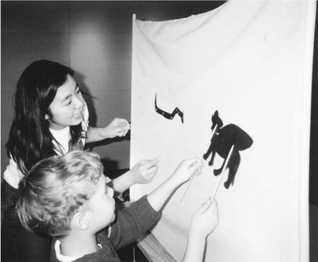
Making shadow puppets based on traditions from Turkey was the highlight at an Oriental Institute workshop for families.