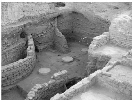
Figure 5. The columned hall showing thick mud floor and the discovered holes

The next season at Tell Edfu will focus on further study of the granary courtyard and the columned hall by extending the excavation area toward the north and east. Ancient Egyptian administration is mainly known from texts, but the full understanding of the institutions involved