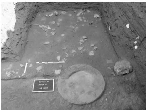
Figure 6. Last layer of occupation of the columned hall