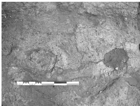
Figure 7. Holes in the mud floor of the columned hall