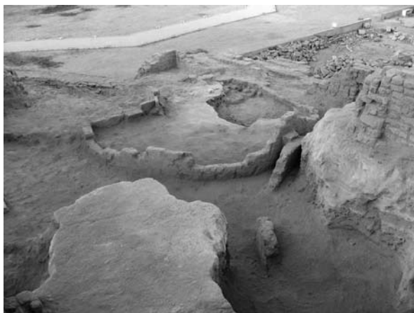
Figure 3. Silo 502 and the corner of the silo court enclosure wall

During the 2007 season, analysis and drawing of material from the 2005 and 2006 seasons was carried out by Natasha Ayers and Richard Bussmann. Most of the finds excavated this season came from the rubbish layer, context 2218. A large number of stones (grinding stones, worked stone, etc.) also came from the same layer. The ostraca analyzed and photographed this year are also mostly from context 2218. Thirteen new ostraca have been recovered; most are Demotic, but