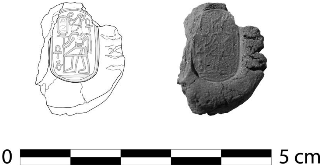
Figure 8. Seal impressions of the Twelfth Dynasty showing the king wearing the crown of Upper and Lower Egypt

and their role within towns and cities has been so far difficult to grasp because of the lack of archaeological evidence with which textual data needs to be combined.