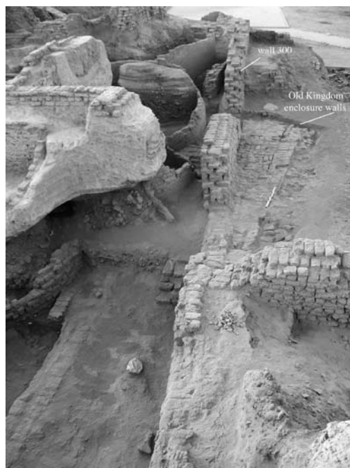
Figure 4. Parts of the Old Kingdom enclosure wall on the surface