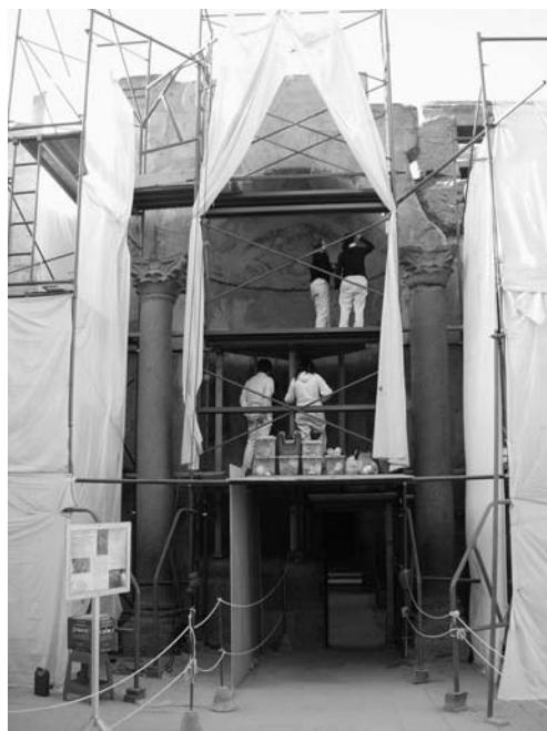
Figure 11. Italian conservators cleaning the southern wall, Roman Vestibule.

Hiroko and Tina also supervised the construction of 70 m of small-fragment storage shelving along the inside of the eastern block-yard perimeter wall and oversaw the creation of eight new damp-coursed storage mastaba/platforms for fragmentary material recovered in previous seasons from the eastern garden and eastern Roman gate area. Three large 6 × 6 m square platforms were designed specifically for the restoration of sphinxes of Nectanebo I from the Karnak/Luxor sphinx road (fig. 10). These had been quarried in the medieval period, broken up into several hundred pieces, and reused in a foundation that reinforced the north bastion of the eastern Roman gate. Analysis of the sphinx material