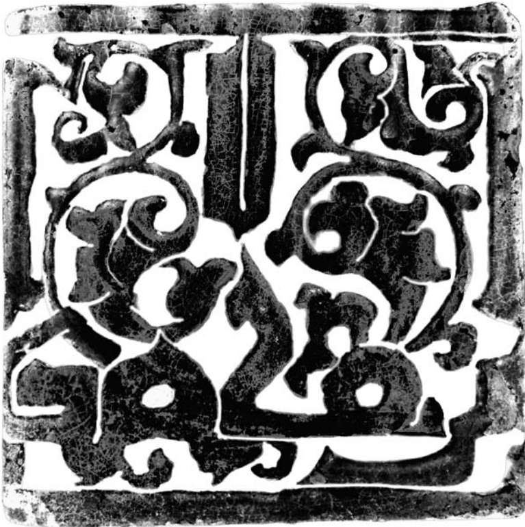
Figure 3. Design of a turquoise glazed tile from the Iranian city of Rayy