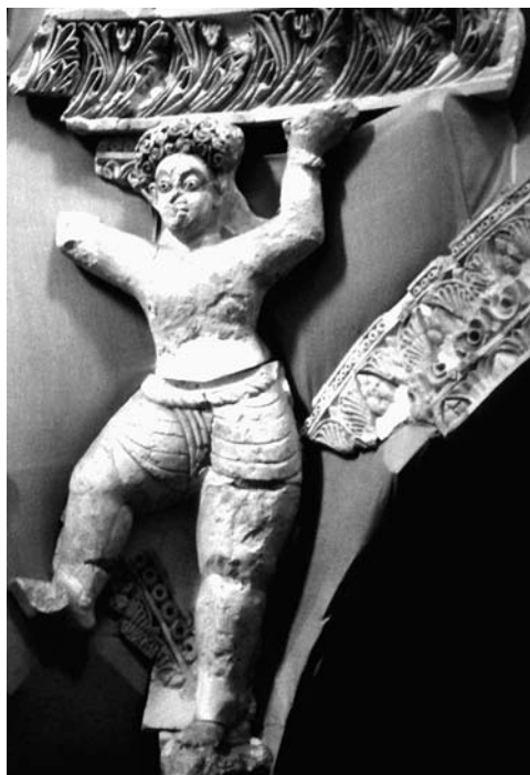
Figure 1. A stucco caryatid from the early Islamic bath at Khirbat al-Mafjar

The Oriental Institute has played an increasing role in the rapidly growing body of evidence and theory in this discipline. There is a growing awareness of the necessity for studying medieval archaeology in the Near East. On the one hand, Islamic materials provide a connector to the past, showing the continuation of most ancient accomplishments unique to the Near East (fig. 1). On the other, the Islamic era provides a connector to the present, making archaeology relevant and important to modern Middle Eastern studies. Perhaps no one has better exemplified this potential at the Oriental Institute than Robert McC. Adams; I have attempted to recognize the accomplishments of his research in an article, "Islamic Archaeology and the 'Land Behind Baghdad,'" for his festschrift presented in 2007.