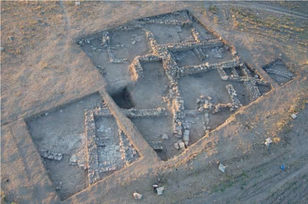
Figure 5. Aerial view of Byzantine construction on the terrace