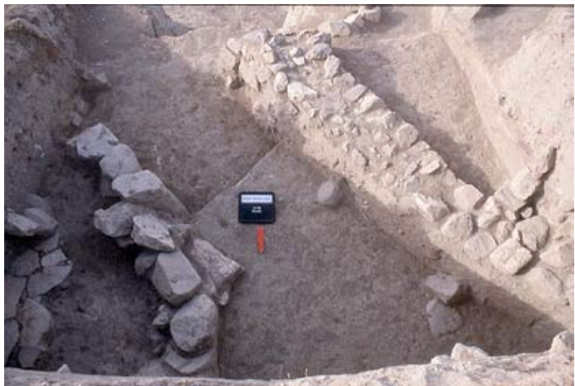
Figure 18a–b. The (a) Eastern (2008) and (b) Western (2005) piers of the Late Iron Age gate

In the 2008 season we continued to sort out the complexities of the Iron Age settlement. Our primary accomplishment in the Upper South Trench was to unearth the eastern pier of a Late Iron Age gate connected to a fortification wall (fig. 18a). The western pier was unearthed in 2005 (fig. 18b) (Gorny 2006: 15, fig. 4). The gate and associated wall seem to be contemporary with the Iron Age wall on the north slope of Çadır Höyük, and probably form part of that period's defensive system. Also found inside the eastern pier was a second, flimsier mudbrick wall that is a little later than the eastern pier and seems to represent a narrowing of the original gate during the Late Iron or Hellenistic period. This also corresponds to a narrowing of the western pier that was recorded in 2005 (Gorny 2006: 15, fig. 4). The area was also heavily pitted,