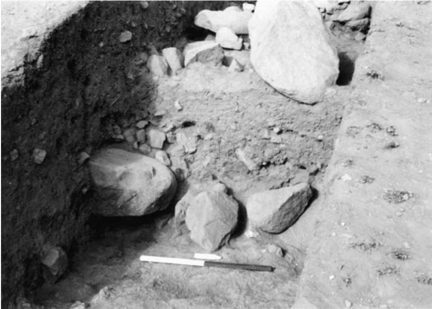
Figure 3. 1994 photo of area we returned to in 2008