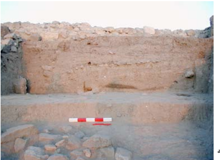
Figure 17a–b. Striated Hellenistic lenses from (a) the Upper South Trench and (b) the East Trench

We undertook one project in 2008 that involved the citadel. This entailed an examination of the Byzantine wall foundations at the top of the Eastern Step Trench, in square 800.910. We had already noted the striated lenses of soil under the wall (fig 17a) and had wondered about their date. To the east of the striations there is a small wall jutting out of the mound that we have determined is Byzantine. The wall is set in a foundation trench that cuts the striations. By taking down the top levels of these striated soil lenses we were able to determine that the various