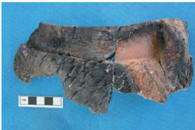
Figure 14. Chalcolithic pottery vessel from under the large mudbrick construction

associated with the Early Bronze I enclosure wall are on a different orientation than the earlier Chalcolithic enclosure wall. The Early Bronze I wall is oriented toward the spot where the late blockage of the Chalcolithic gate occurred, presumably in the Early Bronze I, period as indicated by the pottery (Gorny et al. 2002: 14, 132, fig. 9). The orientation of the Chalcolithic enclosure wall was slightly different, being set a little farther south. Mudbrick now appearing under and to the east of the long north–south mudbrick structure may be part of the mudbrick superstructure of the Chalcolithic enclosure wall. The burned room beneath and to the west of the mudbrick structure seems to be contemporary with the so-called “burned room” found in 2001 (Gorny et al. 2002: 113) and may well provide graphic evidence of the destruction that made a new enclosure wall necessary. This conflagration could also correspond to burning around the Chalcolithic gate and suggest more than a local destruction, as was posited in earlier theories (Steadman et al. 2008a; 2008b). Within this scenario we can better see how the H-House might have fit in. We know that the Chalcolithic enclosure wall was clearly cut by Early Bronze I inhabitants who constructed a small wattle-and-daub home in the place they cut the wall. Soon afterward, however, the building was built over by the people who built the Early Bronze I structure we are currently investigating. I believe that this later mudbrick