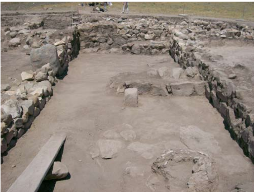
Figure 6. Long hall after excavation, showing later bench (rear) and wall (foreground)