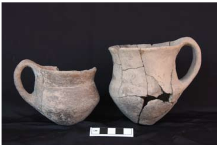
Figure 16. Early Bronze I cups from large mudbrick construction