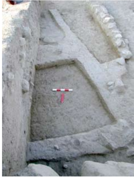
Figure 11. Transitional Chalcolithic–Early Bronze I building