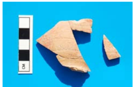
Figure 8. Byzantine pot inscribed in Greek from the Byzantine terrace

It is important to note that we are also undertaking a magnetometry survey on the Northeast Terrace. Early efforts show hot spots under the surface along with what we presume to be walls. In many cases, these structures align themselves with our already-excavated walls and provide us with important information for developing our 2009 strategy. The geophysical maps should be finished soon and we intend to continue this critical effort in 2009.