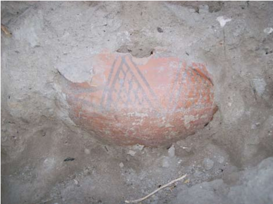
Figure 20. Iron Age pot found in the Upper South Trench