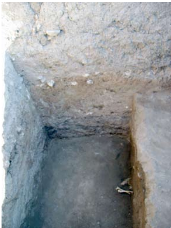
Figure 9. Sounding with layer of white stones visible in mid-picture and burial below

Immediately beneath the layer of white stones and clay was a mudbrick construction barely discernible from the soil around it. The