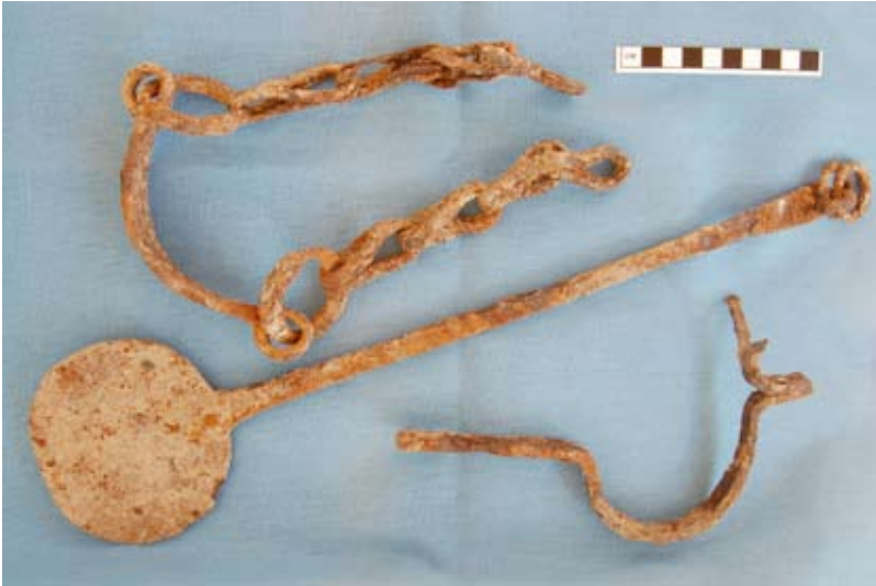
Figure 7. Horse-related materials from the terrace