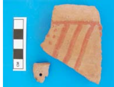
Figure 21. Example of Dark Age pottery from the Upper South Trench