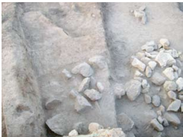
Figure 13. Early Bronze I "enclosure wall" showing packing and wall's mudbrick "casemate"