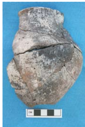
Figure 15. Early Bronze I pottery from large mudbrick construction