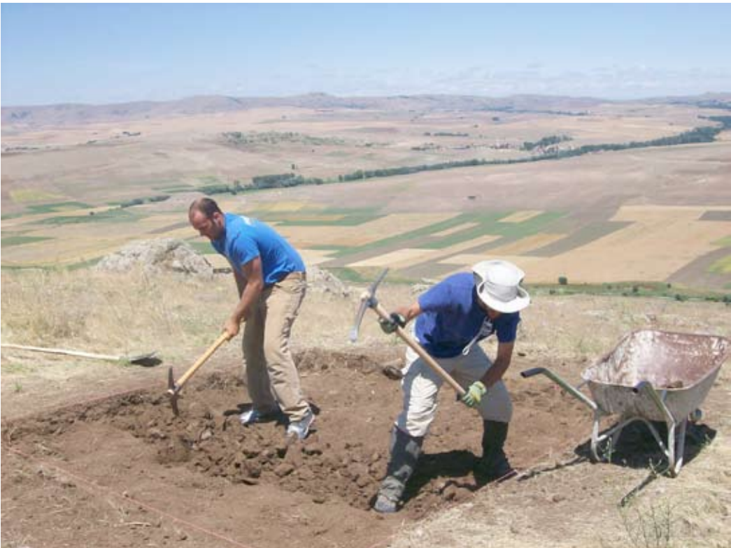
Figure 23. Beginning the sounding on Çaltepe, with the heights of Kerkenes Dağ in the background

In the end, the sounding reached a depth of one meter and produced primarily a very hard mudbrick detritus. Small amounts of pottery were found in the mix, but it was mostly Byzantine with a scattering of earlier Hittite sherds. Thus, while we were unable to locate the Hittite loci, we were able to confirm its use by the Hittites in the second millennium. Although success eluded us in our first attempt to locate the center of Hittite cultic activity on Çaltepe, we are encouraged by the results and intend to try again in 2009.