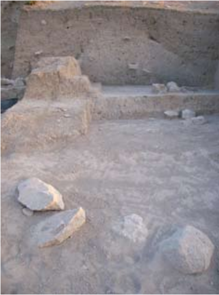
Figure 10. Large mudbrick construction in Lower South Trench