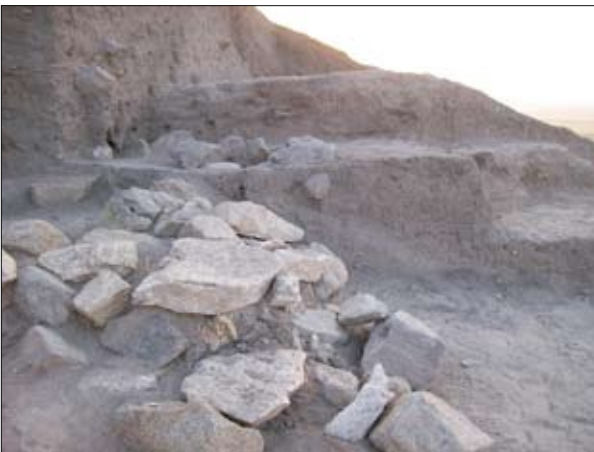
Figure 12. Stone wall leading to the large mudbrick construction