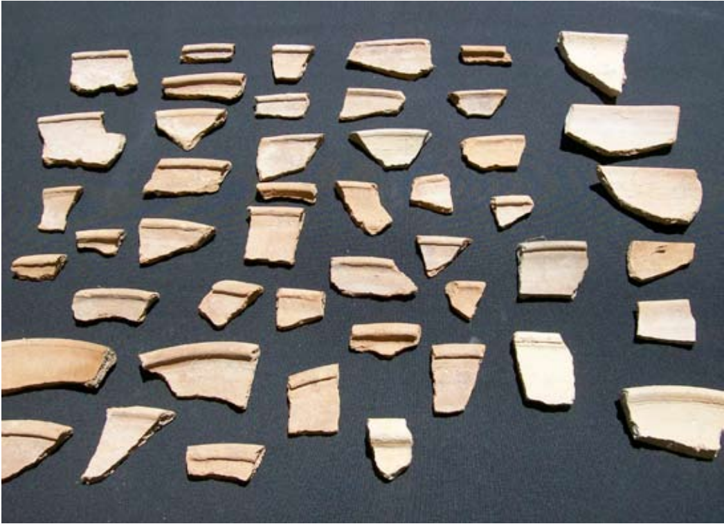
Figure 2. Hittite Empire-period rims from eroded floor area of square 800.910

plaster floors of the “Temple” building (F 67), and to the left of the wall that separates the floors from an outside area. More pottery remains in the baulk so it is safe to assume that this is a rich deposit of Hittite Empire-period materials. In any case, this corpus of pottery provides us with an important focal point for our investigations of the Hittite Empire period. Bits and pieces of carbon were also found and may come from a burning of the town, which may explain how the pottery came to rest there.