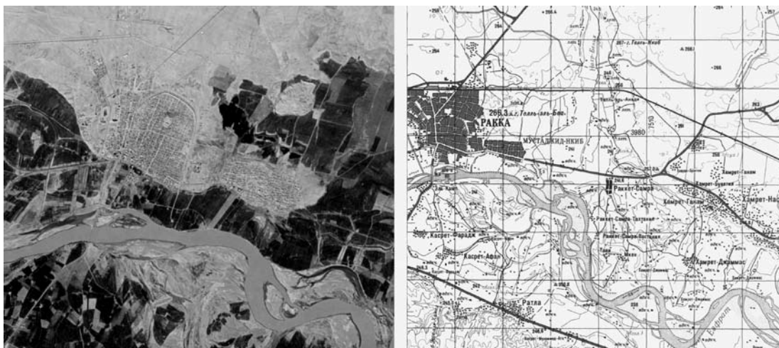
Figure 6. This year CAMEL, on behalf of the Oriental Institute’s Tell Zeidan Project, purchased a historical topographic map of Raqqa in Syria to aid the archaeological survey around Tell Zeidan. This map (on the right) is one of a large series of topographic maps of the Middle East created by the Soviet Union during the Cold War. The portion of the map right around Raqqa is compared here with a U.S. Declassified Spy Satellite (Corona) image taken on November 4, 1968 (on the left). Both the map and photo show the notable horseshoe-shaped wall of the Islamic-period city