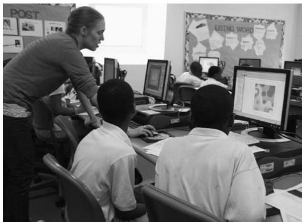
Figure 1c. Both the map and the recorded data were then imported into GIS software on computers at the school. Students learned how to use the software to analyze the spatial distributions of the artifacts and then using clues contained in a fictitious ancient text they were able to draw hypotheses as to where a golden medallion might be uncovered