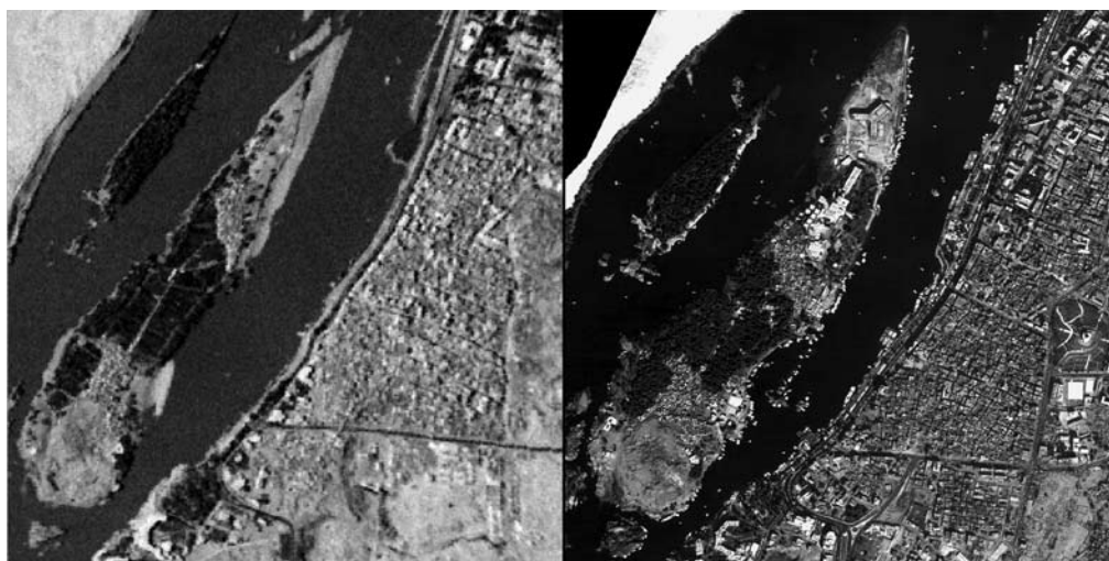
Figure 5. U.S. Declassified Spy Satellite images, also called Corona images, are an important part of the historical depth of CAMEL's holdings. These photos, taken largely in the 1960s and 1970s, were first declassified in the mid-1990s. An ongoing CAMEL project to georectify these images allows users to directly compare them digitally to more recent satellite imagery. Urban and agricultural development can then be analyzed to see how it has impacted archaeological sites in the intervening decades. These two images are of Elephantine in Egypt. On the left is a Corona image from July 19, 1963 and on the right is a DigitalGlobe Quickbird-2 satellite image taken on January 6, 2008. In the 2008 image, you can see new development such as the Movenpick Hotel and resort complex on the northern part of the island. On both images the archaeological site is visible on the southern part of the island, but with noticeably more encroachment from buildings today than in 1963

of a particular artifact mentioned in a fictitious ancient text. This taught students about the interdisciplinary nature of archaeology, helped them understand specific challenges faced by Near Eastern archaeologists, and demonstrated the utility of using GIS software for spatial analysis just like CAMEL does. CAMEL's outreach was also enhanced through an article about its work, "Layers of the Past: Combining Data from Two Centuries' Worth of Images Creates a New View of the Ancient Near East," that appeared in the May/June issue of Archaeology magazine. This is the latest in a series of publicity and articles on the work of CAMEL, which continue to attract the attention of people around the world. While CAMEL has always provided data from its collections as freely as possible to hundreds of users who have contacted us, publicity like this increases the number of people interested in donating their own maps and data to CAMEL's collections and the number of people interested in putting these unique datasets to good use.