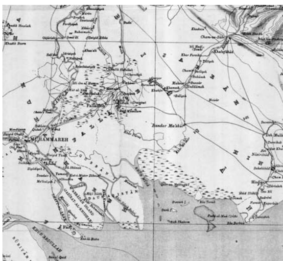
Figure 2. This British Survey map of the head of the Persian Gulf was produced in 1915 and is now a part of CAMEL’s digital archive. Historical maps such as this one contain a great deal of information that had been lost by the time more modern imagery and maps were produced. For example, this map shows areas of marsh in southern Iraq that tragically no longer exist today. It also shows portions of canal systems, the reconstruction of which has been essential to understand more ancient landscapes of southern Mesopotamia