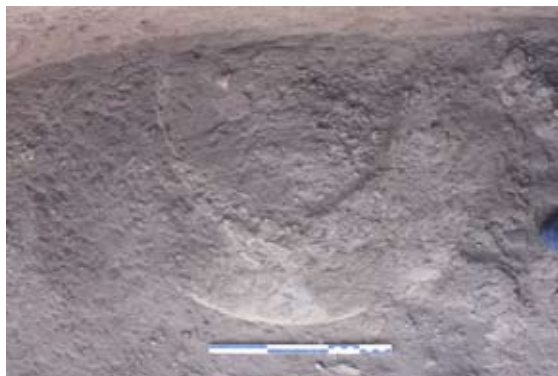
Figure 12. Negative imprint of an octagonal column visible on a column base

The majority are scarab seals showing the typical decorative spiral motifs of the late Middle Kingdom; however, a few have personal names and titles. In 2007 we discovered several seal impressions showing the figure of a king wearing the crown of Upper and Lower Egypt with a tiny cartouche in front of his face that can be read as “Nimaatre,” which is the throne name of Amenemhat III (see News & Notes 198).