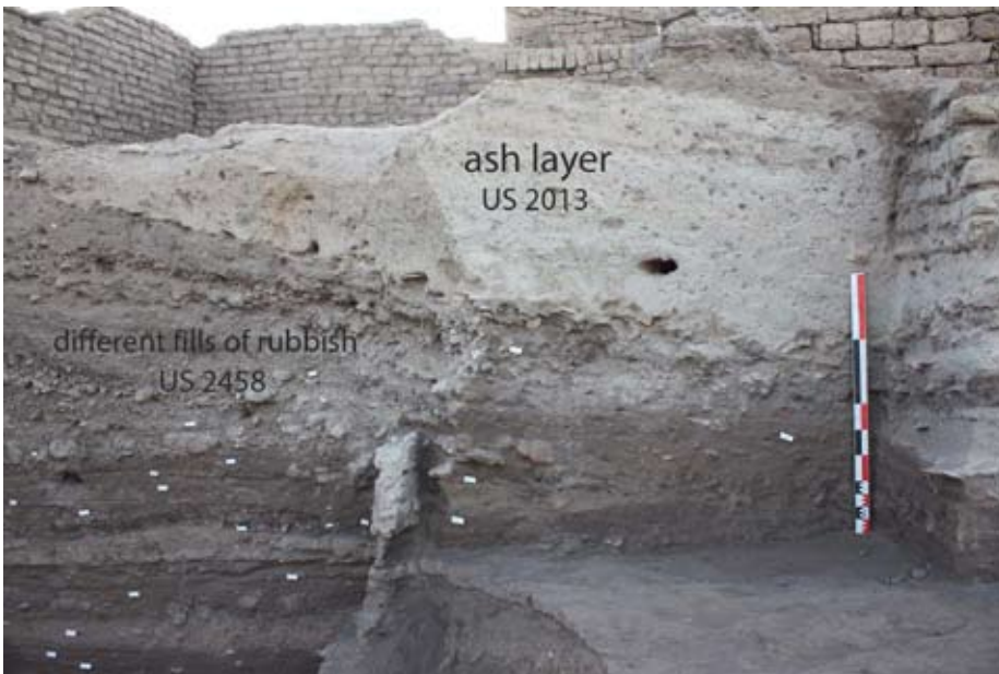
Figure 2. Refuse layers of the New Kingdom

reliable archaeological contexts are extremely rare, especially for the period in question.