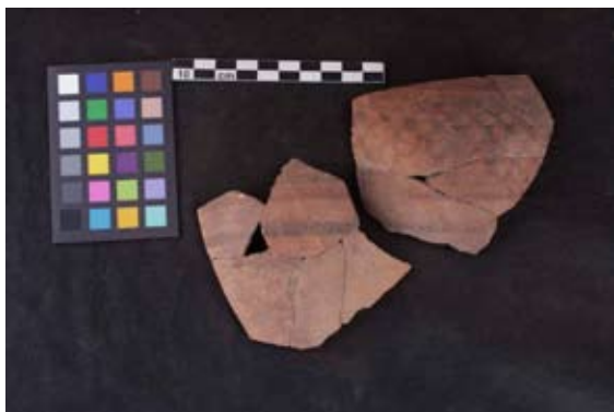
Figure 11. Pieces of Levantine Painted Ware jug found in the columned hall abandonment layer