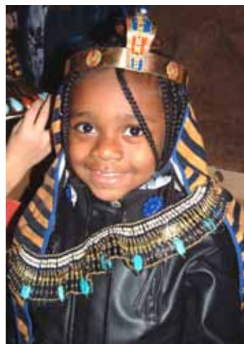
Figure 19. A young visitor is all smiles after dressing up in items from “King Tut’s Closet” during Mummies Night, our annual pre-Halloween celebration for families.

The KADC was the site of two family events this past year — the sold-out “Dig It” program and the very successful birthday-party pilot. And visitors at the Museum took home 11,816 of our bilingual Family Activity Cards — an increase of 9.5 percent over last year. But it was our mummies who took center stage with the family audience when we hosted Mummies Night in October. This pre-Halloween event, which was offered in collaboration with the city’s celebration of “Chicagoween” and Chicago Book Month, has become an annual tradition. Mummies Night featured a showing of “Mummies Made in Egypt,” an animated and live-action film from the award-winning Reading Rainbow series. Docents and interns also offered a “tomb-full” of activities that ranged from folding origami pyramids, bats, and frogs, to dressing up in costumes from “King Tut’s Closet” (fig. 19) to a “Guess the Mummy Lollipops” contest. Mummies Night attracted more than 550 parents and children this year, the largest attendance ever for this highly popular event.