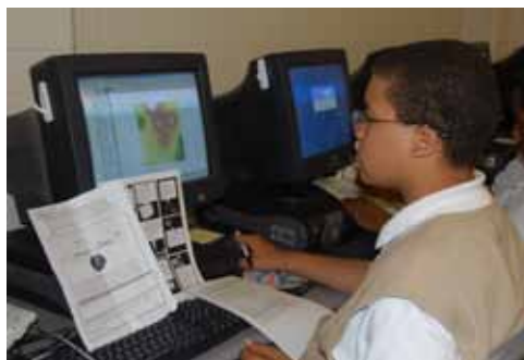
Figure 8. A Claremont Math and Science Academy student in the school’s computer laboratory uses specially designed, student-friendly GIS distributional analysis worksheets to hypothesize the location of the “rare medallion” during the Museum Connections program supported by the Chicago Public Schools.

guide archaeological study of the past. This approach fit perfectly with Claremont’s goal to integrate technology into their curriculum, especially for the sixth grade, where teachers had planned to introduce Geographic Information Systems (GIS) into studies of the ancient world and earth science. Their objective was to put students’ interest in technology to work in ways that would inspire development of critical and intellectual skills in science, social science, math, and computing, helping prepare students for high school, college, and employment.