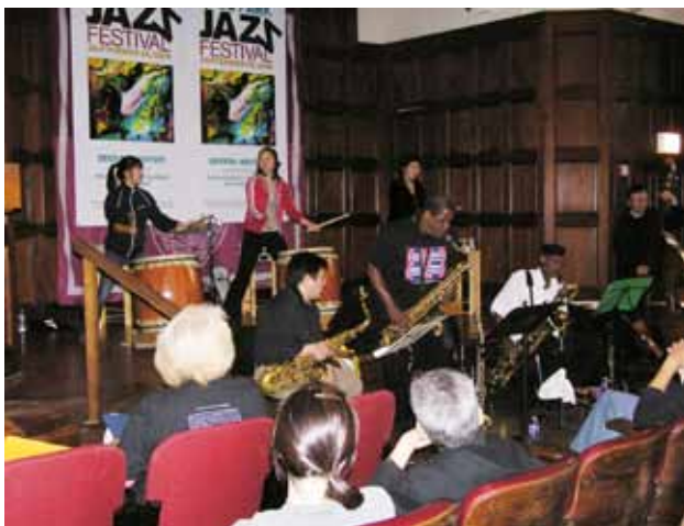
Figure 13. The Tatsu Aoki Ensemble filled Breasted Hall with an amazing fusion of ancient Japanese music and American jazz sounds during the Hyde Park Jazz Festival.

filled every chair in Khorsabad Court for two concerts in that magnificent and acoustically perfect setting. All told, these concerts attracted more than 500 visitors. Most asked to be signed up for the E-Tablet and are now regularly receiving program information, news, and membership information.