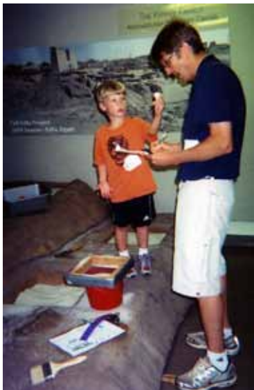
Figure 19. "Dad, look what I found." A father and son team up to excavate and record their discoveries during a KADC program for families as part of the Neighborhood Adventure Series sponsored by the Chicago Office of Tourism.