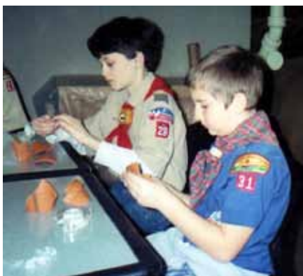
Figure 20. Boy Scouts from Troop 28 intently engage in reconstructing pottery during a KADC program to earn their Archaeology Badge.