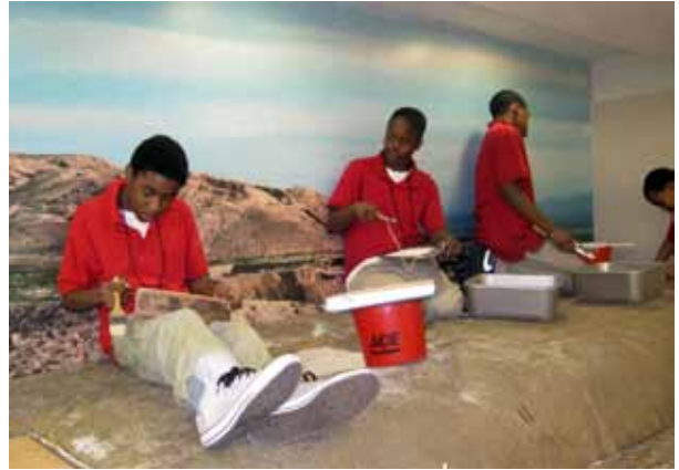
Figure 17. Students from Johnnie Coleman Academy, one of our MAPS partner schools, excavate, record, and analyze discoveries during their KADC experience at the Oriental Institute.

While many of our grant-funded programs enable us to provide extraordinary resources and learning experiences for teachers, the MAPS program is unique in that it focuses on bringing museum educators into the classroom to work side-by-side with teachers, joining with them to integrate museum resources and field trips directly into the classroom curriculum. We look forward to an ongoing relationship with the MAPS program and the meaningful partnerships it encourages between the Oriental Institute and the Chicago Public Schools.