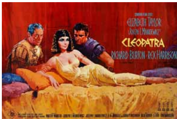
Figure 9. Filmgoers at our Sunday film series enjoyed a spectacular cinema epic when we screened the 1963 version of Cleopatra during Women’s History Month in March

Empowering teachers to enrich student learning through meaningful study of ancient civilization is also central to the mission of Public Education. Grant-funded support is the vital foundation that enables us to provide innovative and in-depth on site and online learning experiences for teachers and their students. This year we completed two major grant-funded multi-year initiatives and received support for two new projects. All are helping us reach teachers and students in ways that will be meaningful and beneficial well into the future.