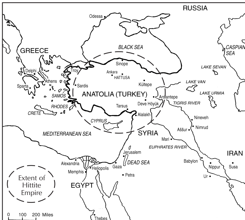
Map of the ancient Near East.

powers of the ancient Near East alongside Egypt, Assyria, and Babylonia as well as the Mycenaean kings of Greece. In the heyday of Hittite power, the empire stretched from the west coast of Anatolia to the upper Euphrates region in the east and covered much of modern-day Syria in the south. The island of Cyprus likewise fell in their sphere of influence. A remarkably continuous line of kings ruled this vast domain in an efficient system of provinces and provincial capitals from the central seat of administration, Hattusa, some 100 miles east of Ankara. Shortly after 1200 B.C., threatened by incoming hordes from the west, the Hittites decided to abandon their capital and moved toward the southeast, suddenly disappearing from history and taking with them the Hittite language.