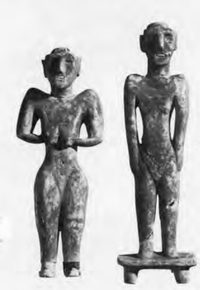
Female and male statuettes, gypsum with traces of red paint, Tell Fakhariyah, Syria, possibly 9th century B.C.

A special exhibition, "The Unseen Collection: Treasures from the Basement," featuring objects long stored in the Oriental Institute basement, will open October 21, 1986. Some of the Museum's unseen treasures will be brought out of storage and put on display for the first time. The exhibition will feature objects recovered from the Institute's excavations, as well as objects which have been donated to the Museum over the years. This is a unique opportunity to view objects in the Museum's collection that are not normally on display to the public. Institute members attending the gala "Passport to the Past" benefit for the Museum on October 20th will have a special preview of this exhibit. The exhibition closes on January 4, 1987.