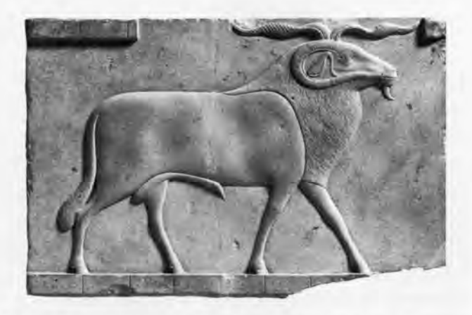
Striding figure of a ram, a sculptor's study or votive plaque, limestone, 332-30 B.C., Egypt, OIM 18212.

A special exhibition, "The Unseen Collection: Treasures from the Basement," featuring objects long stored in the Oriental Institute basement, will open October 21, 1986. Some of the Museum's unseen treasures will be brought out of storage and put on display for the first time. The exhibition will feature objects recovered from the Institute's excavations, as well as objects which have been donated to the Museum over the years. This is a unique opportunity to view objects in the Museum's collection that are not normally on display to the public. Institute members attending the gala "Passport to the Past" benefit for the Museum on October 20th will have a special preview of this exhibit. The exhibition closes on January 4, 1987.