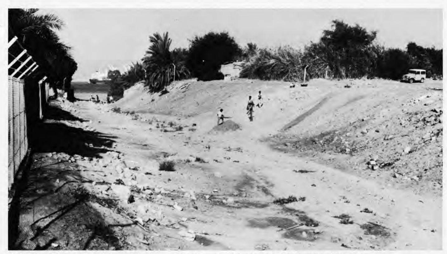
A view down the length of the drainage channel; site A, near the center of the ancient city, is in the middle of the photograph.

daughter, Eileen and Laura, helped with the registration and commissariat and studied the "softest sands" on our hotel beach. In area A, a residential part of the city, Joe found a building made of white sandstone, which was 14 m long, probably square, and probably a merchant's house. South of this building was part of another house, mostly destroyed by the wadi, with a courtyard between the buildings. A street, 2.5 m wide, ran beside these two houses and more houses are visible on the other side of the street. These houses were excavated only to a depth of 2 m but, judging from the remains in the side of the ditch, at least 2 m more remain. Nearby was a small probe (area C) which traced mud brick and stone walls to a depth of 4 m but still did not reach the bottom. The walls have two stages, the lower is Umayyad and the upper is Abbasid (8th to 10th centuries). The upper wall has pilasters, and the stone foundations strongly suggest that the building was a columned hall, possibly an urban khan or merchants' hall.