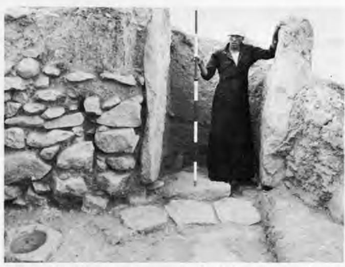
Tall monoliths frame the doorway that leads down steps to the main passageway to the Lower West Gate.

No. 106 November–December 1986 Issued confidentially to members and friends Not for publication