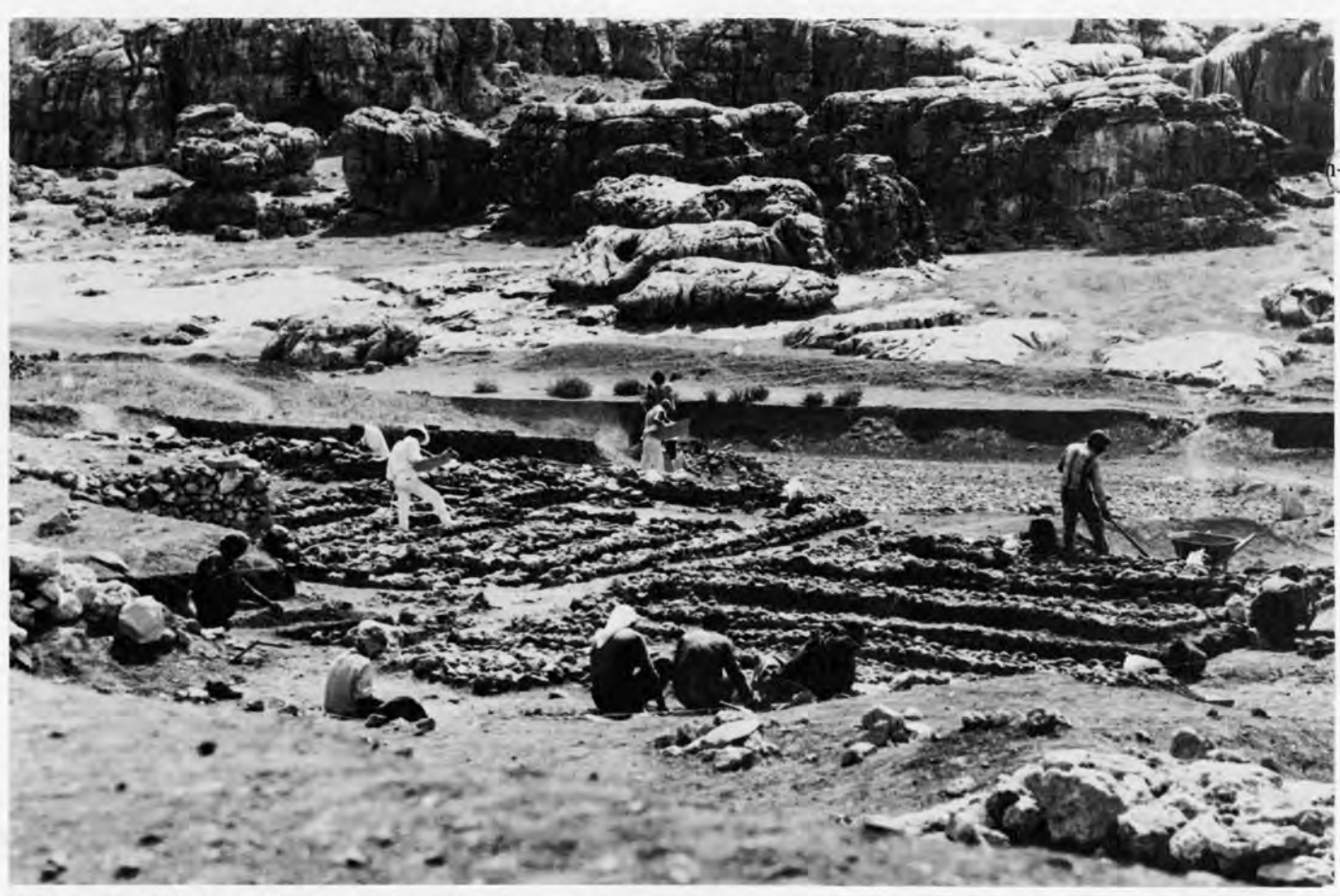
"Grill plan" building traces, Hilar rocks beyond.