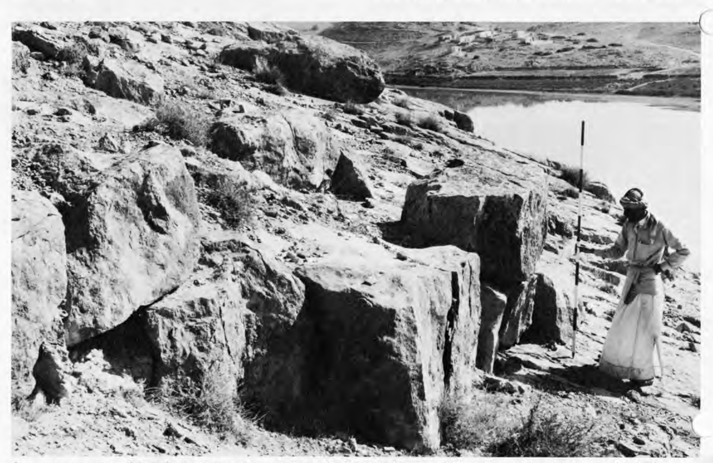
Large stone remnants of the defensive wall on the south side of the Upper Settlement at el-Oitar. Across the river is the small conical site, Tell Ahmar.

We were prepared to change our plans immediately and start digging madly, but we were assured that we have