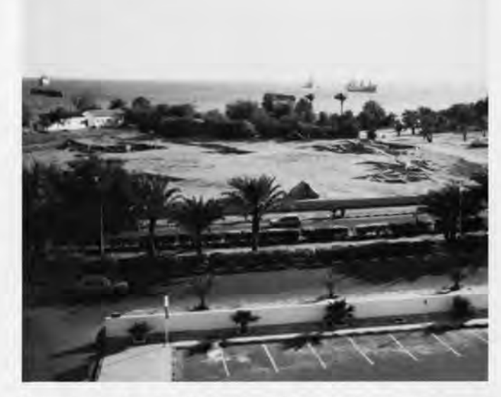
General view of Ayla with the city wall on the right and the central Pavilion building in front of a modern white building.