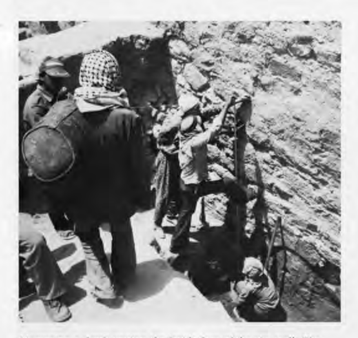
Measuring a depth against the inside face of the city wall. The arch of the door to the tower is visible at the bottom.