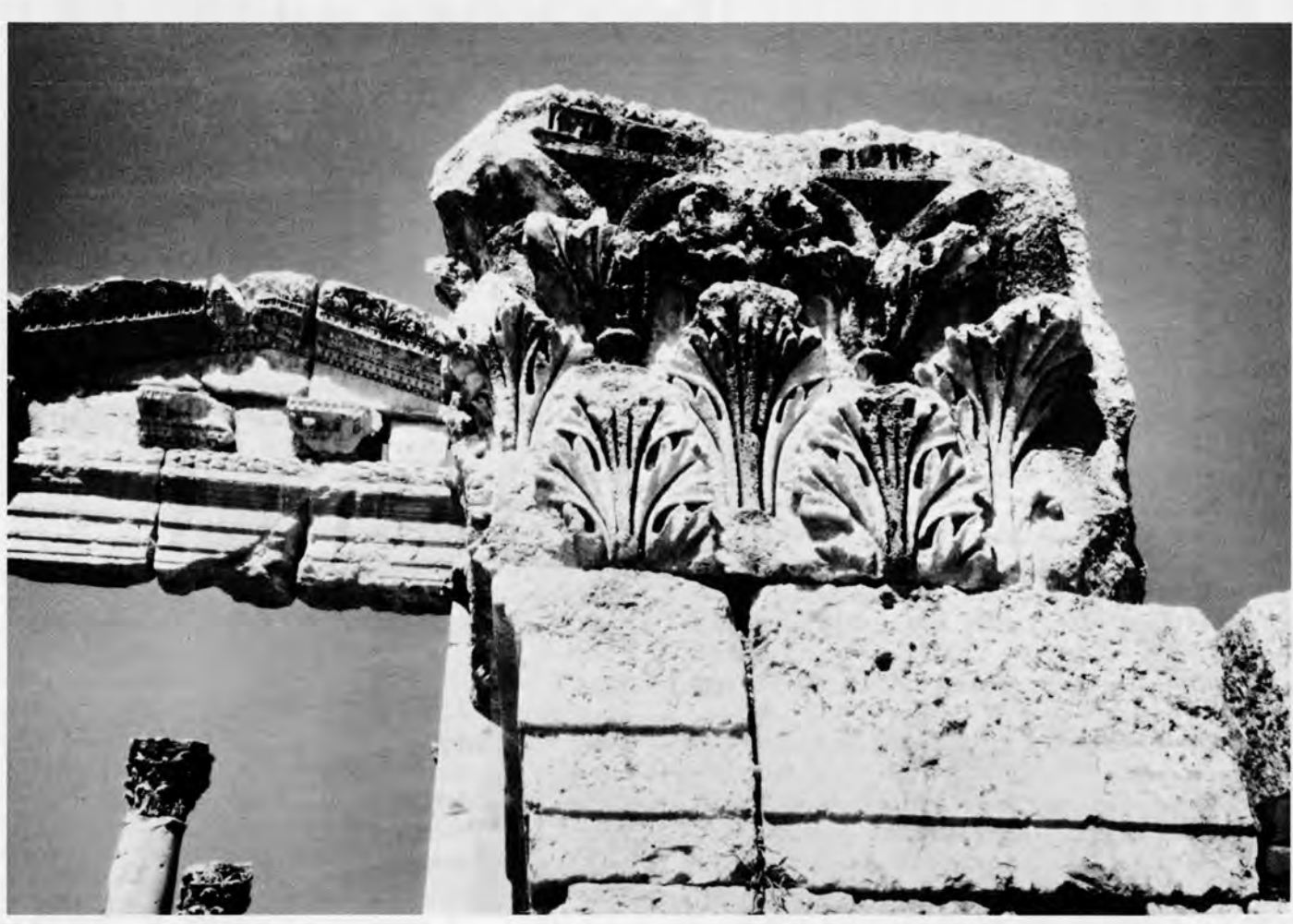
Capital from the site of Jerash, photo by D. Whitcomb.

One of the dreams of every archaeologist is that, in some way, his (or her) site might excavate itself. Ayla, already almost an ideal site, has revealed important new artifacts during this winter. Storm waves can combine with a swell several meters in height when the wind comes from the south. Such waves this winter uncovered two large pieces of carved marble on the beach. The pieces are capitals, adorned with acanthus leaves, which would have fitted the tops of pilasters. Each has an opposing finished edge, indicating a matched set on either side of a monumental gateway. The backs have the remains of iron clamps for attachment. My first thought was the adornment of the Sea Gate (the