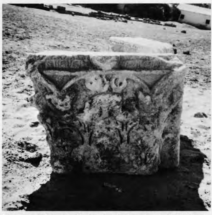
Marble capital found on the beach at Aqaba, photo by D. Whitcomb.

Mr. Balqar promised to remove the barracks, peg out the wall alignments and grid the eastern area in preparation for the excavations this Fall. While we traced the walls, we looked at a plan of the proposed new city marina. Happily we could now determine that the first phase of buildings for it would not conflict with the archaeological remains. The investors in the marina have recognized that this historical monument need not inhibit development but rather can enhance the character of this new usage of the area. The cooperation between these investors, the Aqaba Region Authority, and the Department of Antiquities promises to provide a model for the preservation of cultural heritage.