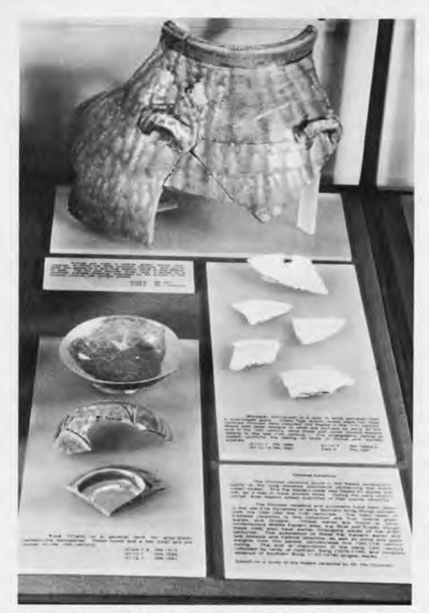
Display of the Chinese ceramics in the Aqaba exhibition, photo by J. Richerson.

Bab al-Bahr) of the town of Ayla, but a search for parallels indicates a more complex story may be involved.