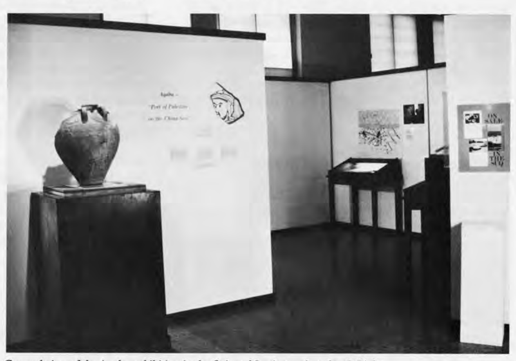
General view of the Aqaba exhibition in the Oriental Institute, photo by J. Richerson.

The Aqaba exhibit at the Oriental Institute will continue into the summer. In the fall it will move to Jordan.