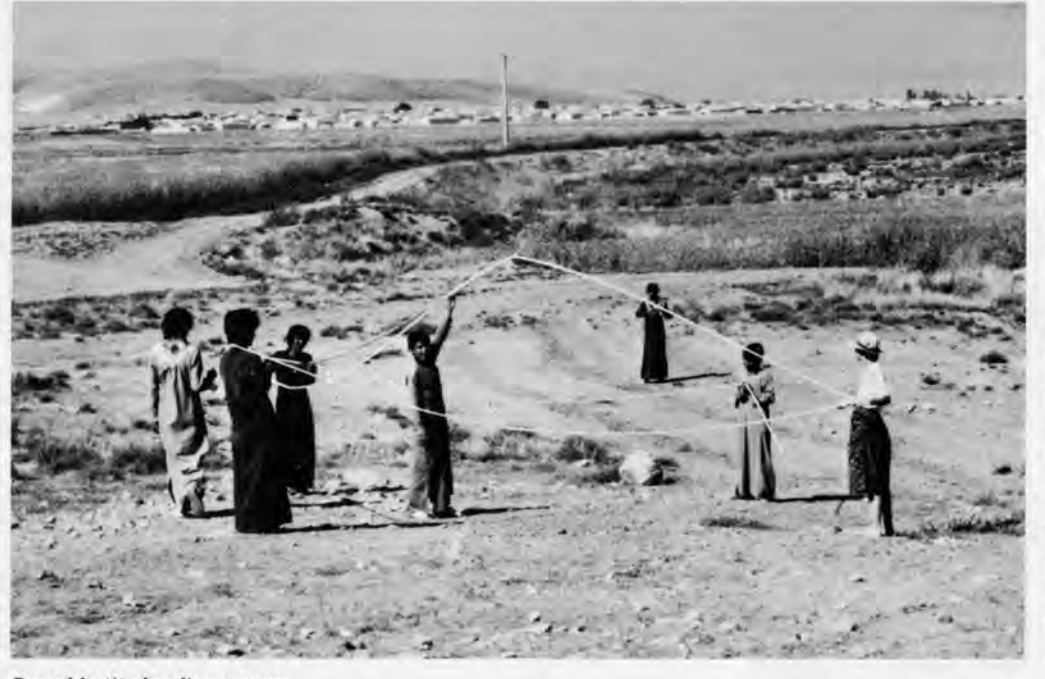
Portable (!) sherding square.

It is just as well that I visited el-Qitar by myself because I wasn't prepared for the damage I found. During the past two years rigs had been drilling test bores in the vicinity, but after our departure last year three were drilled in areas of ancient occupation. One bore, several meters east of the temple, badly damaged