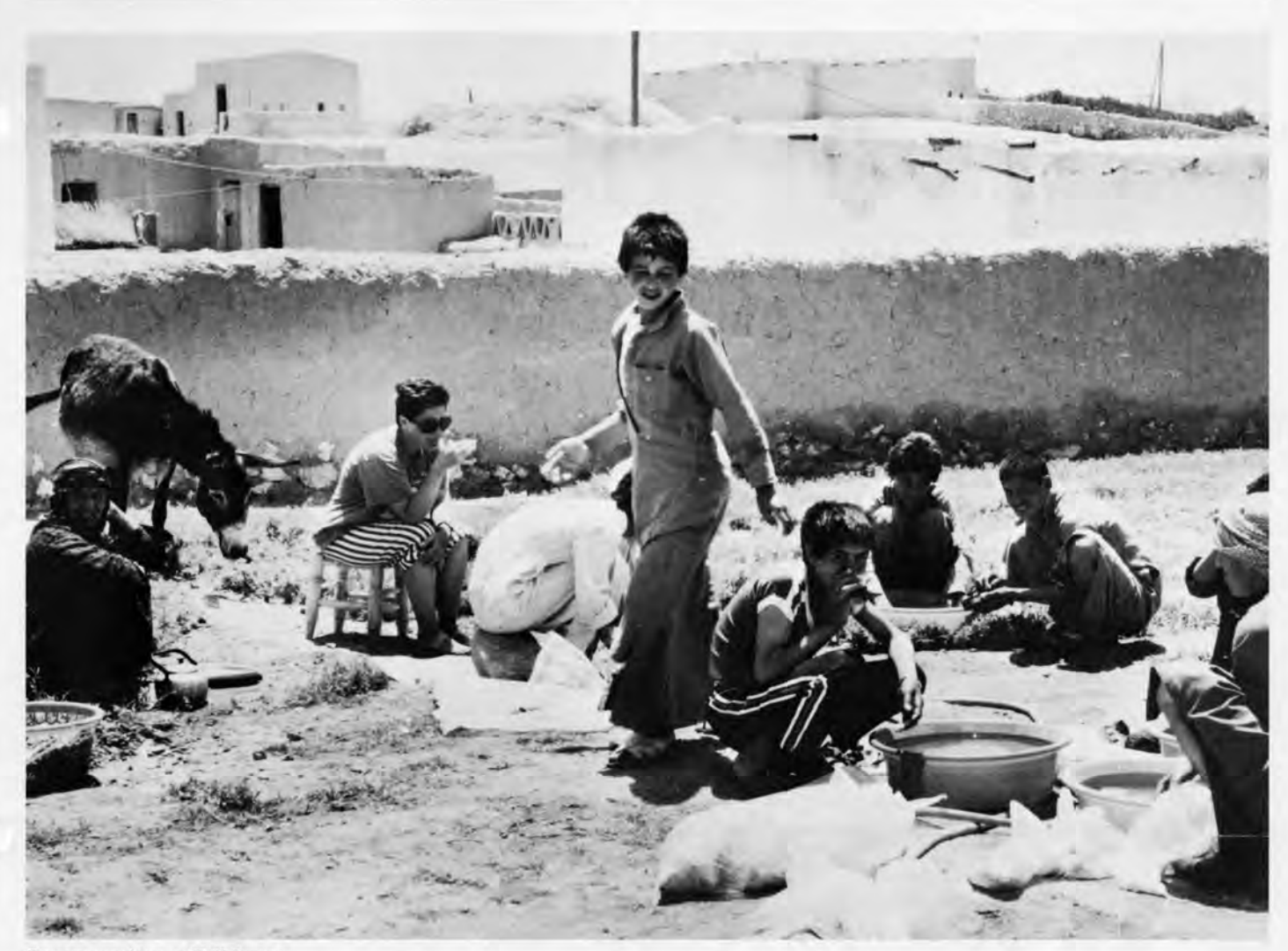
Pottery washing at Tell Banat.

and record parts of it for posterity. As we turn our attention to the Tishreen flood zone, we want to approach it in the same way.