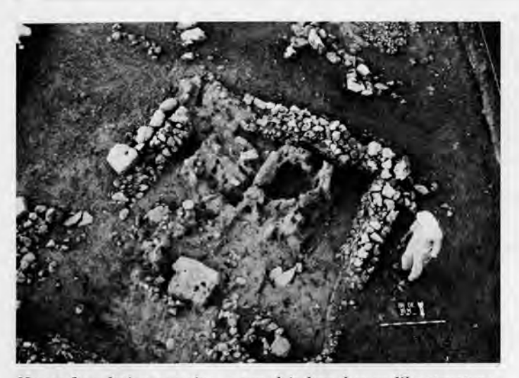
House foundation remains, a sun-dried mud oven-like structure (near upper right center) and (center, lower) a blocky inverted "L" of sun-dried mud, formed to cover a burial.