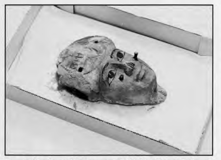
Fig. 1: Wooden coffin fragment (OIM 91), Egypt, Ptolemaic Period. This photograph was taken before the object was moved into the climate-controlled organics storage room. Fragments of the gesso ground and attached paint layer have flaked off the wooden coffin body as it expanded and contracted.