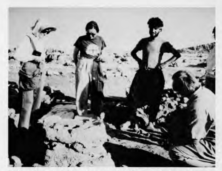
Staff and workmen inspecting the formed, sun-dried mud cover over the burial.