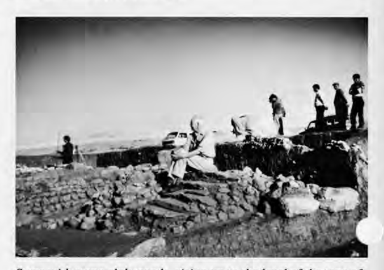
Steps with stone-slab treads, rising up to the level of the tops of the rough stone wall foundations of a house. The walls above the foundations would have been of sun-dried mud brick.

* The recent extension backwards of the recalibration based on tree rings and varves means that the 7000 B C uncalibrated assays we already have for Çayönü really indicate that the village was flourishing around 10,000 years ago.