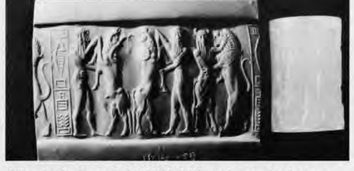
Official cylinder seal of LUGAL.DUR, with a combat between heroes and animals. (See page 4.)