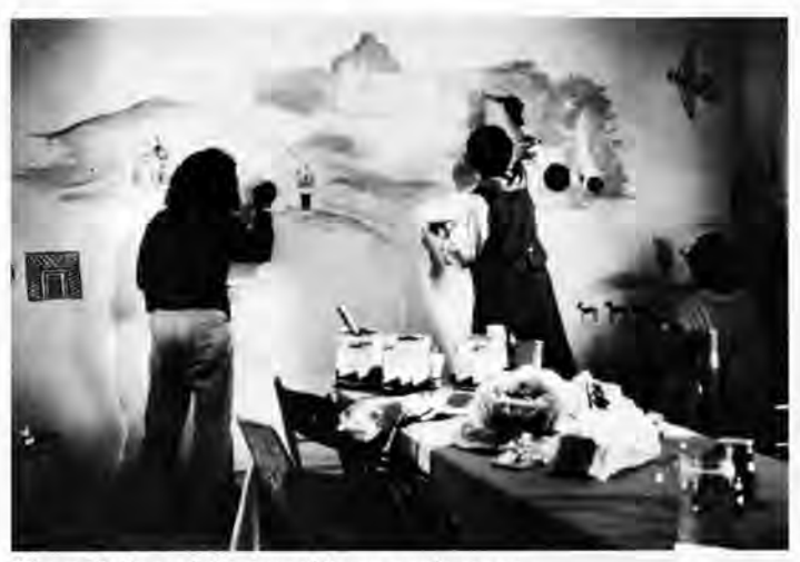
The painting of the mural in an early stage.