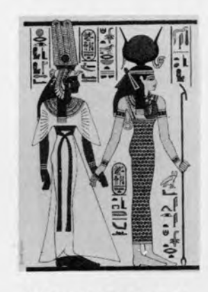
ISIS & NEFERTARI

The Suq offers beautiful hand-printed T-shirts in three unique Egyptian designs. All are made of 100% preshrunk cotton in one comfortable Adult size, large. The multi-colored designs are printed on the front of white, short-sleeve T-shirts. Please specify design when ordering.