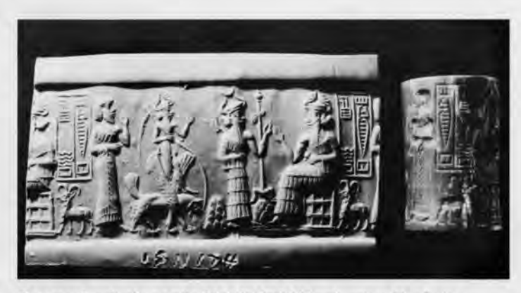
Personal cylinder seal of LUGAL.DUR, showing him being presented to a seated god. (See page 4.)