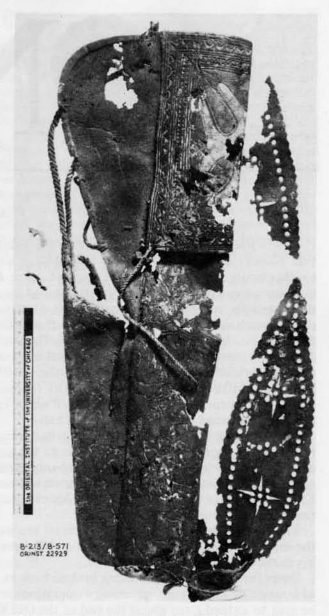
This quiver from Meroitic Cemetery B (grave B-213) at Ballana, Nubia, illustrates the variety of skilled techniques used by ancient Nubian leather craftsmen.