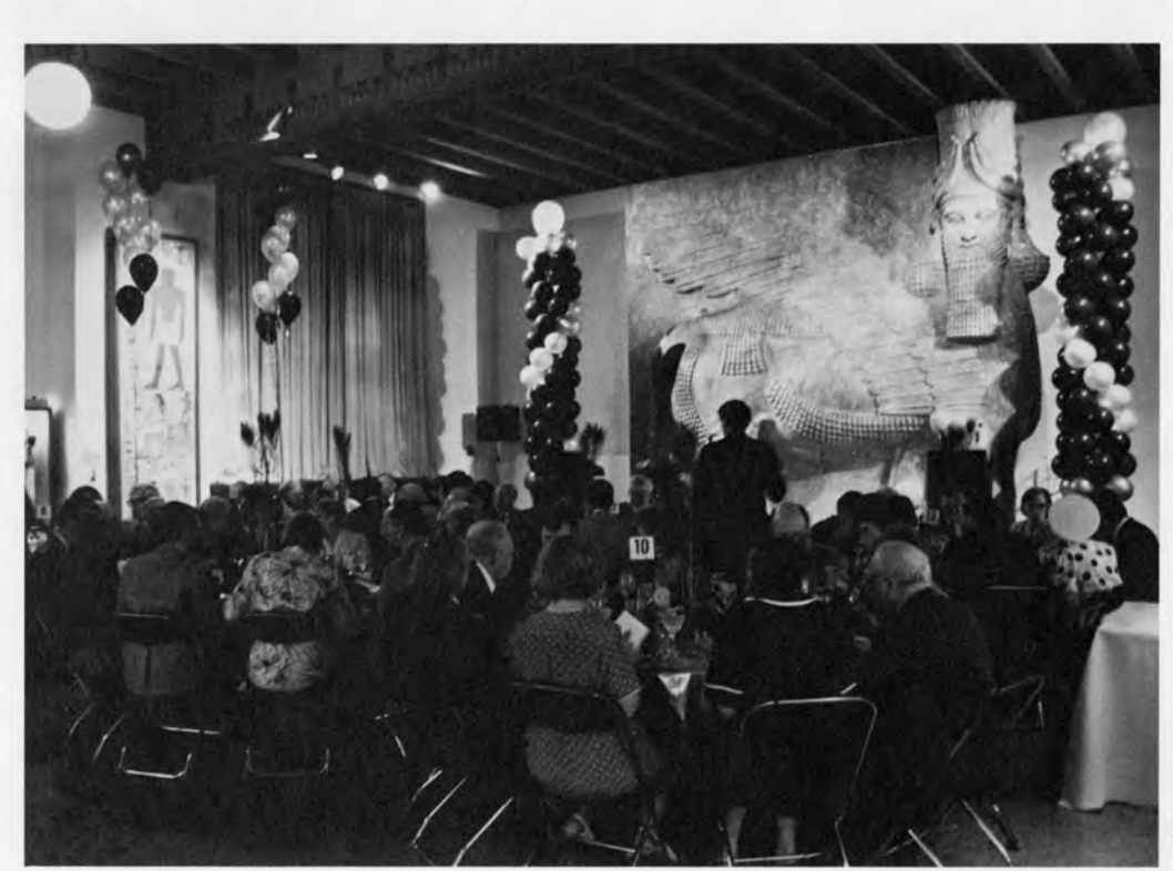
General view of the festivities.