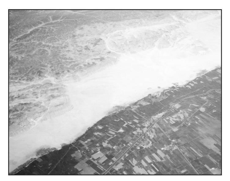
Figure 1. Aerial view of Abydos, probably taken in the 1940s.

My recent research trip to Egypt from February 17 to March 18, 2004, acquainted me with impressive recent steps being taken by the Egyptian government, in collaboration with international teams of technicians and scholars, to prevent damage to Egypt's heritage at Abydos and elsewhere. Of course, initiatives to protect archaeological sites in Egypt are not new. In fact, the Oriental Institute's own Epigraphic Survey was founded in 1924 by James Henry Breasted in response to the threats that even then were apparent to Egypt's monuments. Chicago House, the home of the Epigraphic Survey, continues to be a major force in the preservation and study of the standing tombs and temples of ancient Thebes (modern Luxor). Re-