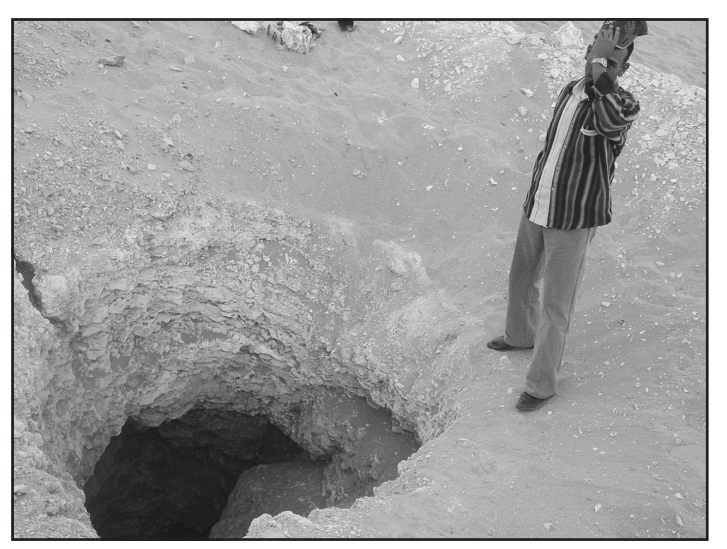
Figure 6. Rock-cut circular shaft revealed by illegal looting activity in the complex of King Ahmose at south Abydos.

Fortunately, the new focus on the largely thankless task of preservation does not mean that new discoveries cease to be made. March 2004 saw the announcement in the New York