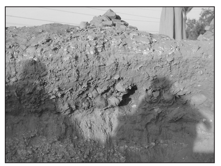
Figure 5. Modern burial pit at south Abydos, with an extensive amount of New Kingdom pottery visible in the section.

rightly brought their work to an abrupt halt. In contrast with our forebears, our expedition recognizes the need for continuity in local tradition; therefore we can only regret the loss of an opportunity to excavate scientifically in this area and take the opportunity to educate our friends in nearby communities on the presence of archaeological material in this area. We were also able to see the traces of unauthorized looting activity in several locations within my archaeological concession, illustrating that our scientific interest in an archaeological zone is often followed by local curiosity (fig. 6). A mixed blessing of this de-