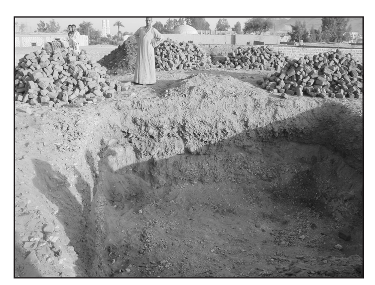
Figure 4. Modern burial pit dug through New Kingdom archaeological strata in the shadow of the Ahmose Pyramid at southern Abydos. Modern needs for cemetery space compete with archaeological site preservation.

My work at Abydos, which I hope to resume this fall, concentrates on a series of monuments and related structures built by King Ahmose at the southernmost part of the site, some six kilometers from the sacred precinct of Osiris. There (as elsewhere at Abydos) our colleague Tomasz Herbich has recently made use of remote sensing technologies such as magnetometry