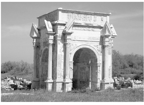
Arch of Septimus Severius at Leptis Magna

For complete itineraries, call the Membership Office at 773-702-9513.