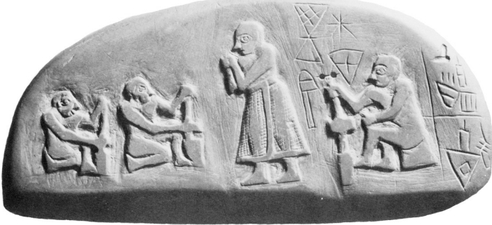
Blau plaque. Ur III. Ancient kudurru ("boundary stone") with possible early representation of a king. Ur III. OIP 104, pp. 39-43, pl. 12