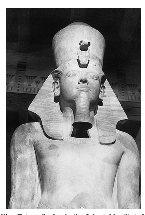
Statue of King Tut on display in the Oriental Institute Museum