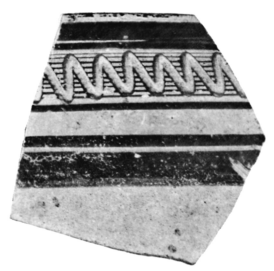
Painted simple ware. Amuq (wavy incisions through paint is a hallmark of Amuq Phase J). OIP 61, p. 442, pl. 89:2

Call Museum Education at (773) 702-9507 for details on fees and each day's schedule.