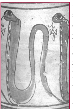
Above: Meroitic jar depicting spitting cobras. Nubia, ca. 200 BC-AD 300. OIM 22563. Top right: Ibis statuette. Egypt, ca. 664-332 BC. OIM 25390