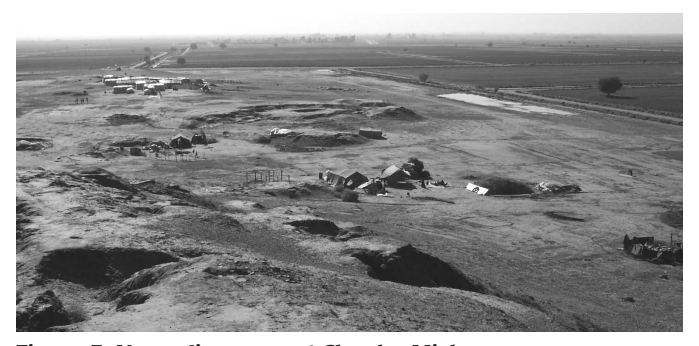
Figure 5. Nomadic camps at Chogha Mish

weaknesses of foreign expeditions, a set of realistic regulations within which such close cooperation can be achieved, and an appreciation for the timetable of the foreign expeditions. In addition, the structure of the type of joint projects conceived by the ICHTO required a substantial number of experienced Iranian archaeologists who could effectively participate in such projects. This has created a major problem in the realization of the ICHTO plan because only a few such archaeologists are still active in Iran. Most of these experienced archaeologists are not even willing to participate in a joint project because they have their own independent field research. That leaves the few experienced and competent young archaeologists who can jointly run an excavation. But because of this shortage most are over-extended; in a single year some may be dispatched to two and even three expeditions in different regions with different sets of archaeological questions. This shortage of qualified and willing archaeologists in Iran actually defeats the entire purpose because almost none of the "joint" Iranian directors actually have enough time to do research.