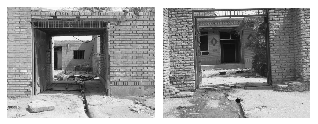
Figure 6. Two of the Dolati burned and ransacked houses

cultivated land. In this general area, only the narrow margins of individual farms and shoulders of the paved roads are left unfarmed. The land never rests and as soon as one crop is harvested another is planted. Sugar cane, wheat, maize, and vegetables are the major crops. Working the land year-round, however, has depleted the soil of its natural nutrients, and farmers rely heavily on chemical fertilizers with long-term dire consequences for the environment.