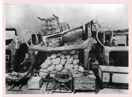
Antechamber of Tut's tomb, 1922.

Expedition photographer Harry Burton documented the clearance of the tomb of Tutankhamun through a series of dramatic black and white images. A selection of these spectacular photographs presented in the Marshall and Doris Holleb Family Special Exhibits Gallery relives the excitement of one of the greatest archaeological finds of the century.