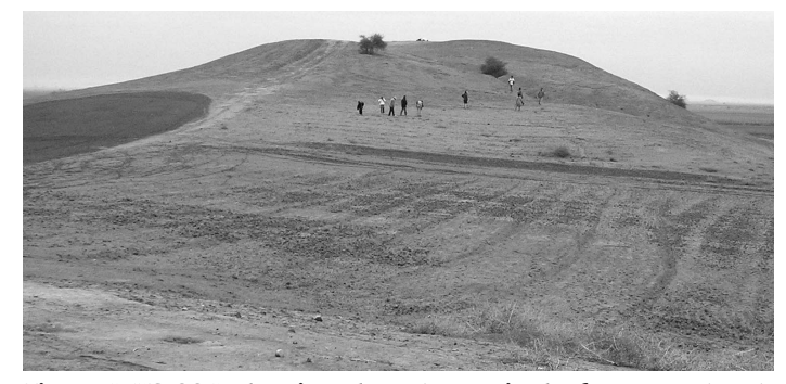
Figure 4. KS-004, showing plowed areas in the foreground and upper left