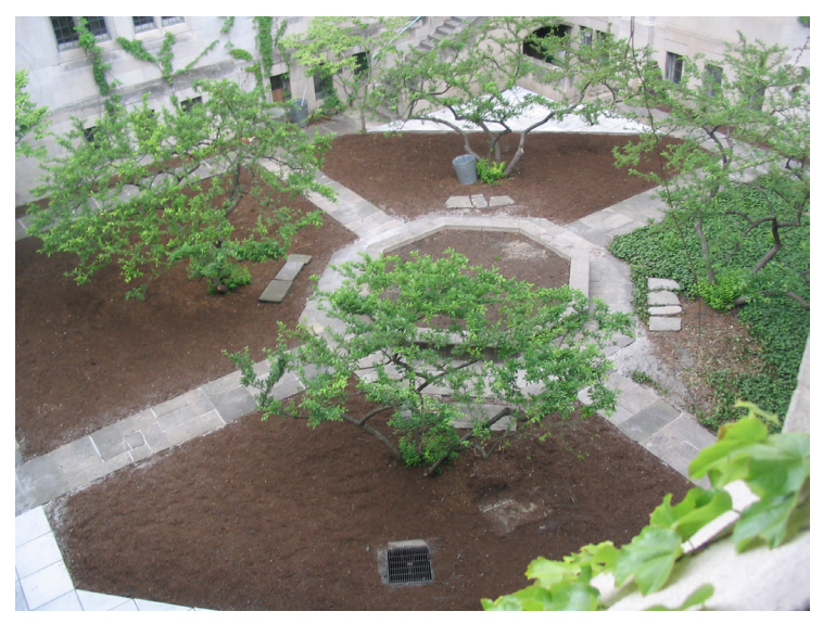
View of the Oriental Institute courtyard after the first stage of renovation. The grounds were cleared of weeds, the pathway leveled and re-laid, patio area expanded, and trees fertilized.

At twenty-seven, she was the only woman among the eleven founders of the American Society of Landscape Architects (ASLA). Today, the ASLA, the national professional association representing landscape architects, has