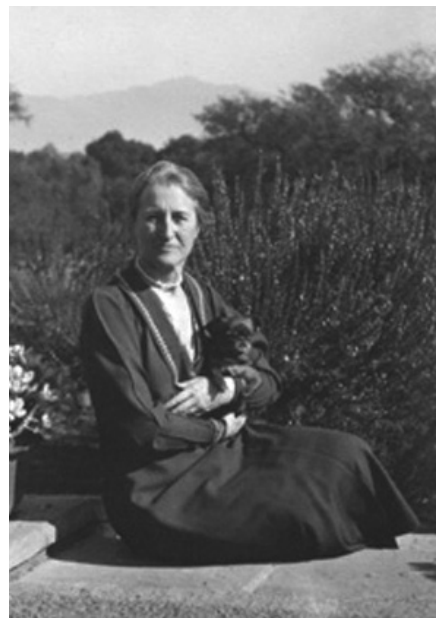
Beatrix Farrand in California (1934)

ies. Farrand's gardens occupy ten of the original fifty-three acres property and contain ten pools, nine fountains, as well as stone sculptures and ironwork mostly designed by Farrand. These gardens are open to the public. More information on Dumbarton Oaks can be found at www.doaks.com.