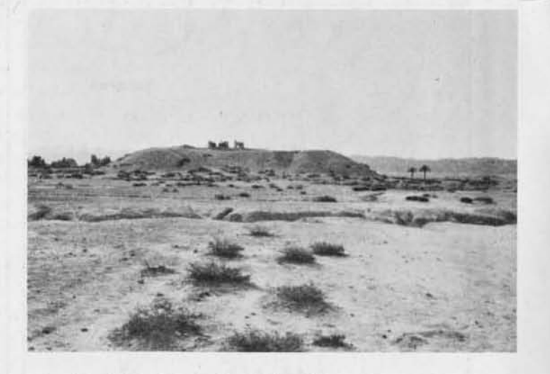
Tul-e Dowlatabad in the Dezhgah valley