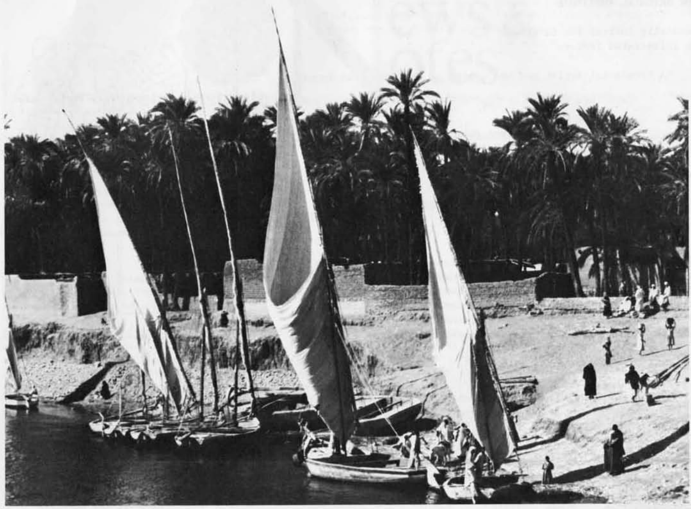
Feluccas on the banks of the Nile-photo taken on last year's tour