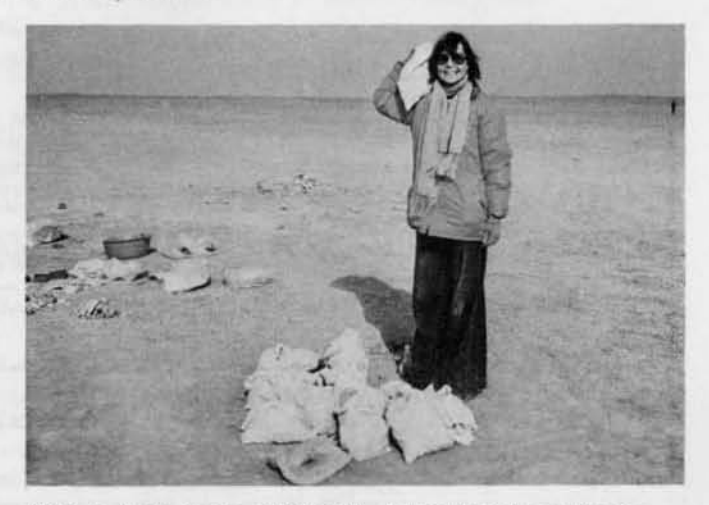
"Why is this woman smiling?" Actually I'm gathering the potsherds for my survey.

Thanksgiving Day was the most memorable any of us will ever spend. We took a motor boat deep into the marshes where little canals branched out from the main