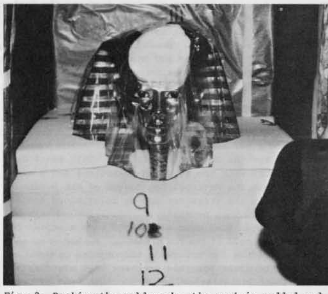
Fig. 2. Packing the gold mask: the mask is padded and draped in Mylar film.

The types of adhesives and consolidants we could use in the repairs were limited to those used back in 1922 when the tomb was first discovered. Howard Carter and Alfred Lucas worked jointly in conserving the pieces. Originally, many of the wooden objects began to shrink and crack when they were taken from the tomb and exposed to the drier air outside. This disturbed their paint and gesso decoration. To stabilize them, Carter coated them with molten paraffin that was absorbed through the surface. This in turn forced us to use a similar waxy material (synthetic microcrystalline wax) to make minor repairs.