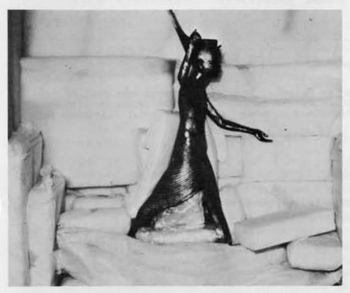
Fig. 3. Packing the Harpooner using small pieces of polyurethane foam.

Several days before the show closed, Janet and I borrowed the $1500 replica of the Selket statue from the Tut Sales Shop. We used it as a model to measure