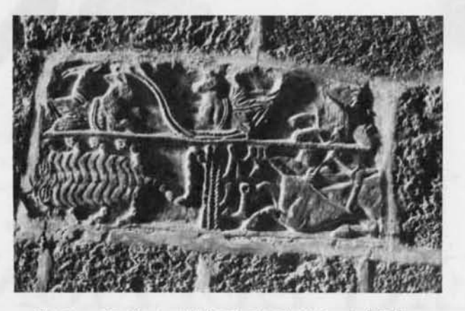
Plaque showing mythical creatures—a leafdonkey, a scorpion, and a centaur,

Like much of the Near East Yemen is presently enjoying considerable prosperity, with the result that ancient remains are being torn down at an alarming rate as the modern inhabitants scavenge for building material and clear new areas for farming. Villagers at Zafar regaled us with stories of how Himyarite material used to be sold for one riyal (25¢) per camel load. In the face of such a situation, we