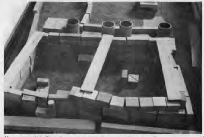
House model. Two boys attempted a reconstruction, from memory and photographs, of the Amarna nobleman's house model at the Oriental Institute.

play corner of their classroom, erected with large building blocks, a reproduction of the floor plan of the nobleman's house.