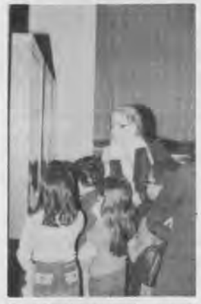
A highlight of the visits was the writing of each child's which was then laminated for durability.

Is the Oriental Institute museum too specialized and too adult-orientated for seven- and eight- year old second graders to understand? As a result of a carefully devised project last spring, the answer is a chorus of "no" coming from an enterprising and energetic father of one of the students, from two innovative and supportive teachers, a daring new museum education co-ordinator at the Institute, co-operative docents, and responsive parents.