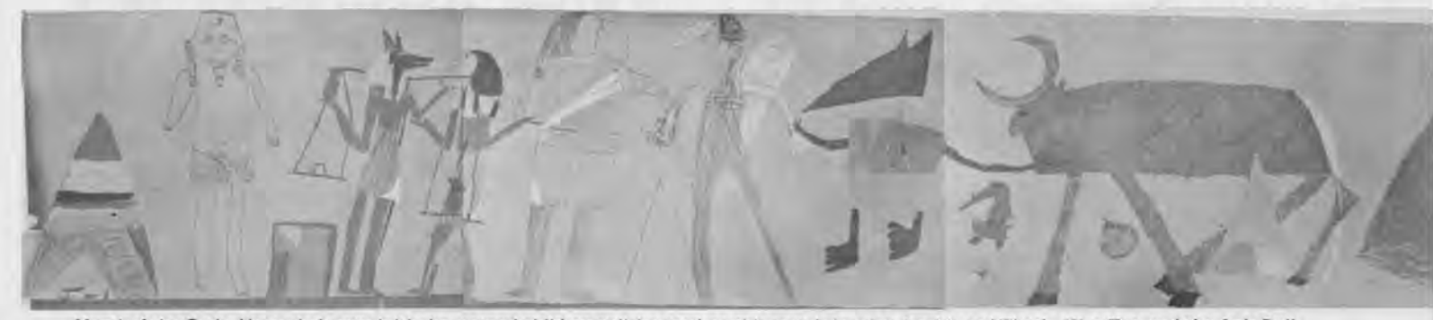
Mural of the Gods. Upon their own initiative, several children collaborated on this mural showing Anubis and Thoth, King Tut, and the Apis Bull.

When the second-graders came for their first visit to the museum, "Egypt Time", as the children themselves named their social studies curriculum unit, had been going on for a week. Interest was high, and the children already knew where Egypt was on the map, the importance of the Nile River, and how the Egyptians irrigated their lands to raise more crops for more food. Their first exposure to the museum was an overview tour of the Egyptian gallery under the leadership of docents who briefly explained the exhibits. The class was