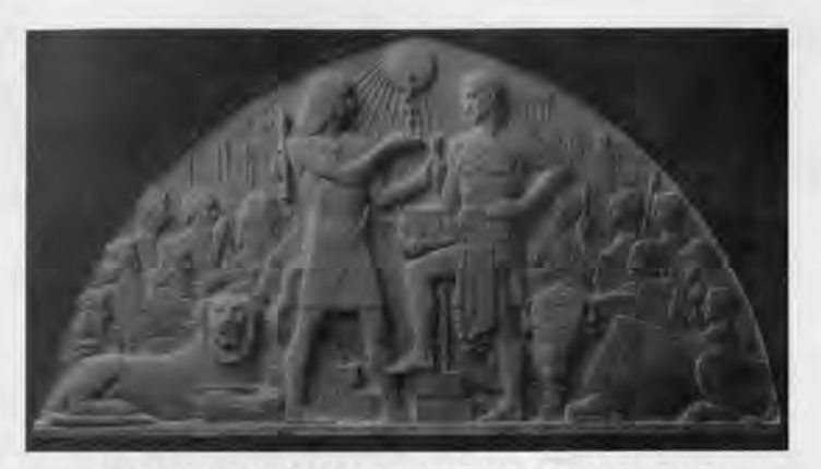
BREASTED HALL IS FIFTY YEARS OLD

In commoration of the dedication of the Oriental Institute building on December 5, 1931, Ulric Ellerhusen's epic relief in the tympanum over the entrance of Breasted Hall is reproduced here. The sculpture and the epic deserve study at all times. In the same spirit of appreciation for modern sculpture as for the ancient Near Eastern collections which are housed within, sculpture which is incised on the outside of the building also deserves recognition.