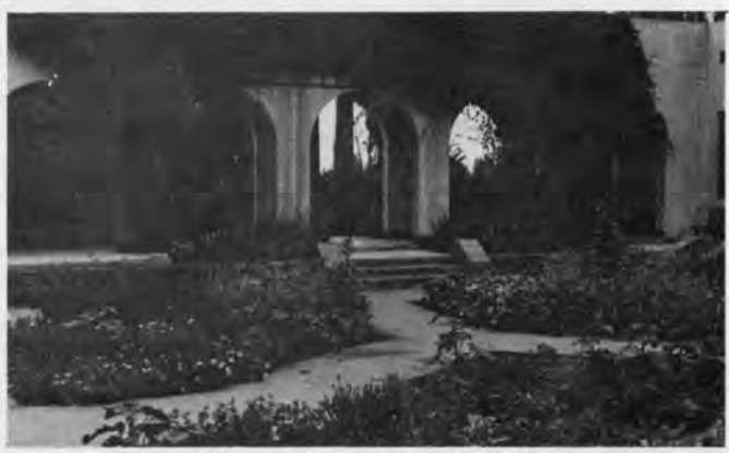
Chicago House today. Here we see part of Chicago House's spacious garden, lying between the library wing, on the right, and the residential quarters. Here, the staff members can relax in surroundings of great natural beauty, featuring a rainbow of colors produced by a host of semi-tropical plants.

Chicago House was built in Luxor on a three-acre plot of land owned by the Trustees of the University of Chicago. Its