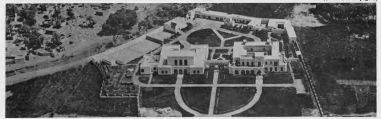
The New Chicago House in 1933. When this aerial view was taken from James Henry Breasted's plane, Chicago House, built of fired brick, concrete, and steel, was only two years old. The limits of the Survey's three-acre plot are clearly visible, since the land is still nearly bare of vegetation. Most of the compound remains essentially unchanged today, but the sweeping vista to the Nile was sacrificed in the mid-1950's when Luxor's river road to Karnak temple was laid down.

Hardly luxurious, the house should still not be compared to the usual dig houses occupied by other archaeological expeditions working around the world. The Chicago House com-(Continued on page 2)