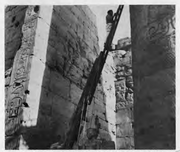
The Final Check. An epigrapher checks a detail on one of the immensional columns of the Luxor Temple. Behind him are statues once inscribed for the famous King Colonnade wall; beneath him are statues once inscribed for the famous King Tutankhamun, but which were usurped by Ramesses II and now carry his name.

necropolis; and with a chronological range including the reigns of Thutmose III and Hatshepsut, Amenhotep III and IV, Tutankhamen, Sety I, Ramesses II, Ramesses III, Ramsses IX and Herihor, Dynasty XXII, and the saite and Ptolemaic periods. The labors of the Epigraphic Survey have already resulted in a steady output of documentary and analytical volumes. These include eight volumes on the mortuary temple of Ramesses III at Medinet Habu; three volumes of Reliefs and Inscriptions at Karnak; The Bei el-Wali Temple of Ramesses II; The Temple of Khonsu I; and The Tomb of Kheruef. Three other volumes are pending as of this date.