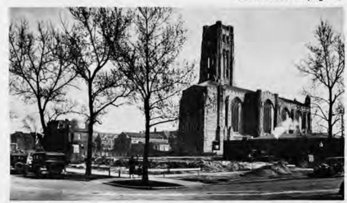
May 1, 1930. Beginning work on the construction site for the New Oriental Institute Building.