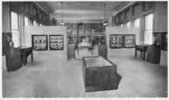
Haskell Oriental Museum Interior, view of North Egyptian room, looking north.

What Breasted intended was that the visitor should become immersed not only in the material remains of the ancient world, but also in the Institute's role in deciphering the interpreting the evidence. Quite early on, he realised that one of the major difficulties, as far as the mass of the public was concerned, was the distance of the Institute from the center of Chicago. One solution, like the "talkie", was both ingenious and characteristic. A poster was produced, not only advertising the museum, but also drawing attention to other aspects of campus life; Rockefeller Chapel with its carillon and organ recitals, walks round the Quadrangles, and important lectures to attend, all dominated by the image of Nefertiti - and the Oriental Institute. A journey to the Oriental Institute was transformed into a package deal.