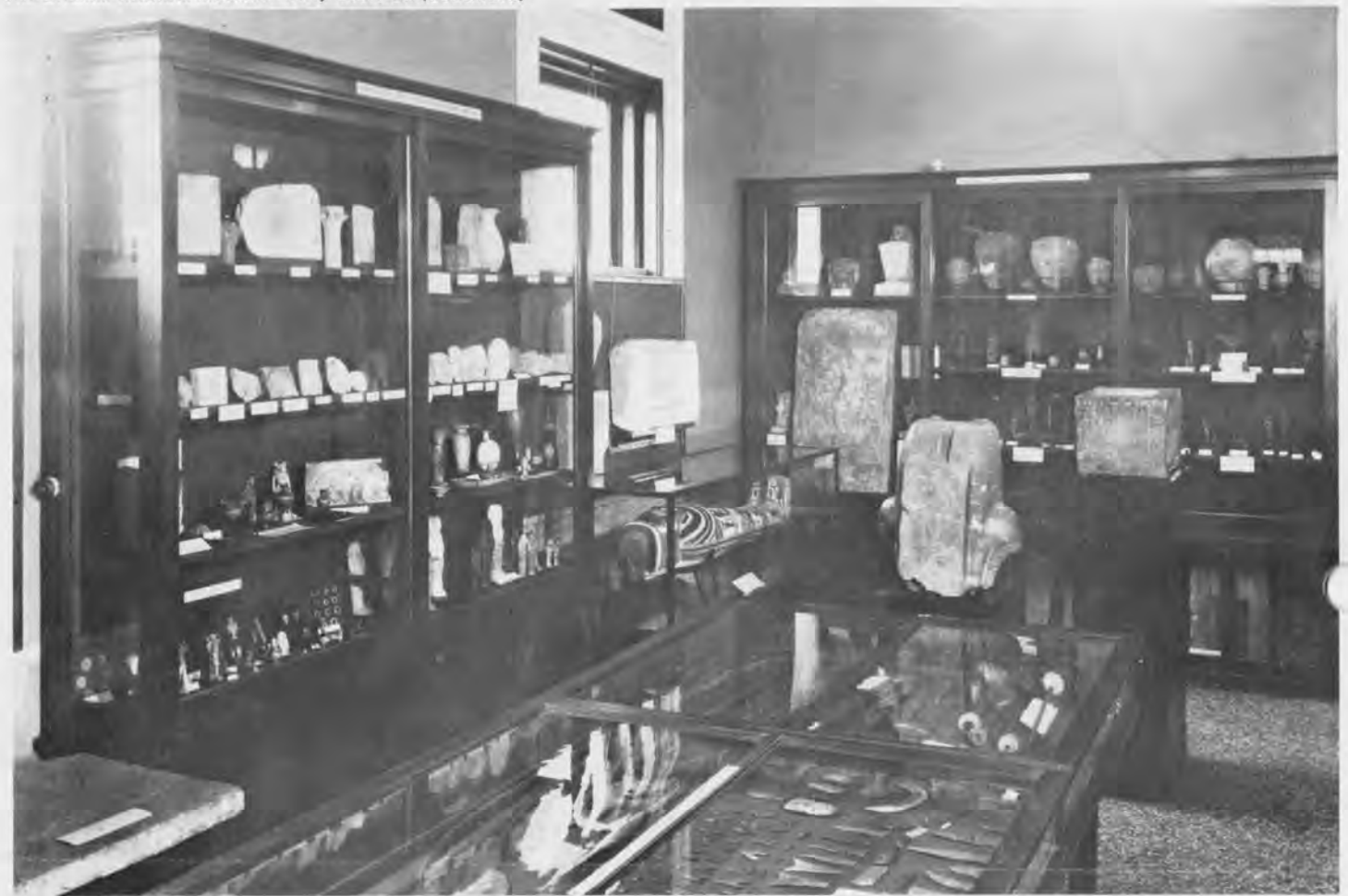
Haskell Oriental Museum. Interior, Southeast corner of north room with antiquities collected by James Henry Breasted during 1919-20.

The Oriental Institute Museum - Fifty Years On (Continued)