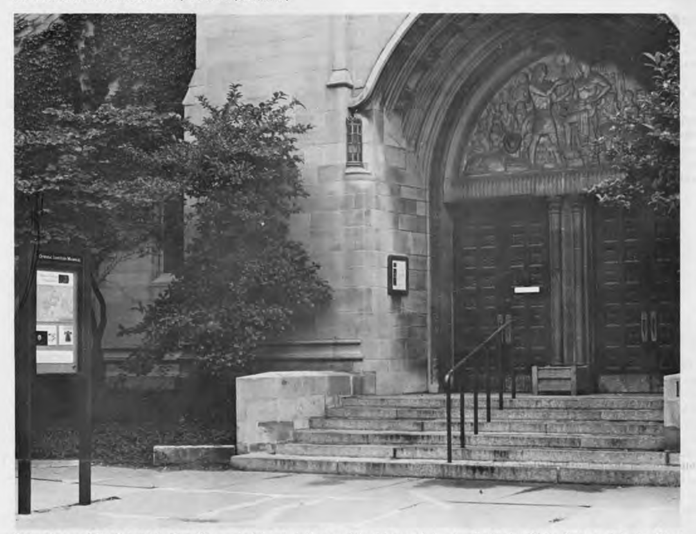
Main entrance of The Oriental Institute Museum building, including new "Special Events" sign, installed Spring 1981.

Almost as soon as the Oriental Institute was completed in 1931, plans were made to enlarge it, and as early as 1933 a scheme was drawn up to extend the building on the south side. After the war, a further plan was made by an Italian architect to split the Institute in two horizontally, with the insertion of a mezzanine floor, and a roof over the central courtyard. Fortunately nothing came of the Italian project, which would have devastated the interior of the building.