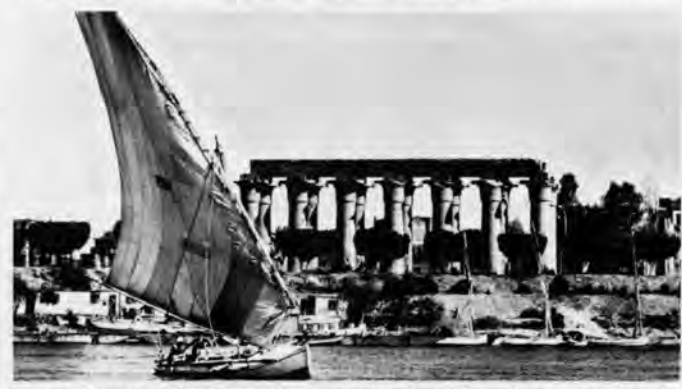
Luxor Temple, felucca in foreground, taken from ferry crossing the Nile.

The next day, we boarded the MS Anni-one of four Sheraton Nile boats, on which we spent two nights docked in Luxor and two cruising to Aswan, with stops at several temples. For some unknown reason, the captain introduced us