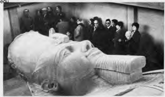
Statue of Rameses II at Memphis.

A member of another group called us "those people who don't like anything new" when we didn't want to visit the "damn" dam but preferred to spend more time at Philae. However, we did find much in Egypt that was interesting and new. Cairo is a fascinating city to explore, and "people watching" is always a favorite pastime. Egyptian coffee and pastry at Groppi's in downtown Cairo are always a welcome break for weary wanderers. Braving the Cairo traffic to get from here to there is a real challenge. My major frustration was not to be able to talk to the people—I must learn Arabic before my next visit.