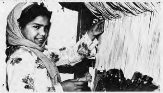
Twelve-year old weaver at Harraniya

We travelled from Cairo to Luxor in a luxurious fifty-plus passenger bus (there were only eighteen of us). The trip took two days, with stops the first day at Karanis, a city excavated by the University of Michigan; the Pyramid of Hawara built by Amenemhat III; Tel el Amarna, the city built by Akhnaten when he abandoned Amun for Aton; and Tuna el Gebel, which takes on an especially mystical quality at sunset. The approach to Tel el Amarna provided much shared hilarity: After crossing the Nile by ferry, we were still a mile or more from the tombs