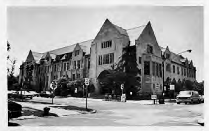
The Oriental Institute, 1983.

hard enough to "make sense" out of one's own excavations. It is doubly hard to do so with someone else's since the new editor of the material must first track down what the original excavator was aiming to do in order to understand the significance of what was found, what was recorded, and what might have been ignored or deemphasized. Since unpublished excavations are no better than destruction of a site, we are trying our own "salvage" project in the basement and the records archives, trying to make the most of the heritage of Near Eastern archaeology which is at the OI.