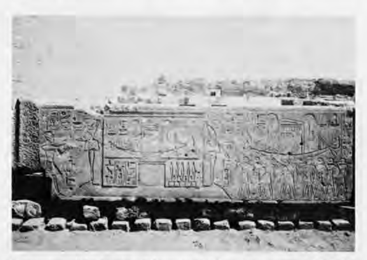
Procession of the barque of Amun to the Luxor way station during the celebration of the Opet Festival in the reign of Hatshepsut; from the Queen's Red Chapel at Karnak, Photo from the Oriental Institute's Photo Archive.

The present Triple Shrine was developed out of the sixth and southernmost of the way stations in which the barque of Amun rested during the Opet Festival in the time of Hatshepsut. It is depicted and named on the red quartzite blocks of this queen's