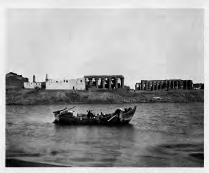
Beato photograph of Luxor Temple after the end of the excavations in 1892. The photographer's house is visible on the river bank opposite the north end of the Colonnade. Photo from the Oriental Institute's Photo Archive.

side and rear walls, two series of kneeling nome-divinities, each headed by a Nile-god, temp. Amenophis III, usurped by Sethos II, with line of text of Sethos II below on side walls, and large cartouches of Ramesses II at bottom. . . . Remains of text of Amenophis III on rear wall. . . . '' This latter text is the socle inscription located, as we shall soon see, just to the north of the columns of the hypostyle, not south of it. The beginning of the descriptive statement should read (with minimal rewriting): '' . . . temp. Amenophis III, erased by Akhenaten and restored by Sethos I, with marginal inscriptions of (Merneptah, usurped by Amenmesse, and finally recut by) Sethos II below on side walls, and large cartouches of Ramesses IV at bottom.' Think of the problems faced by the scholar who does not have ready access to the temple itself!