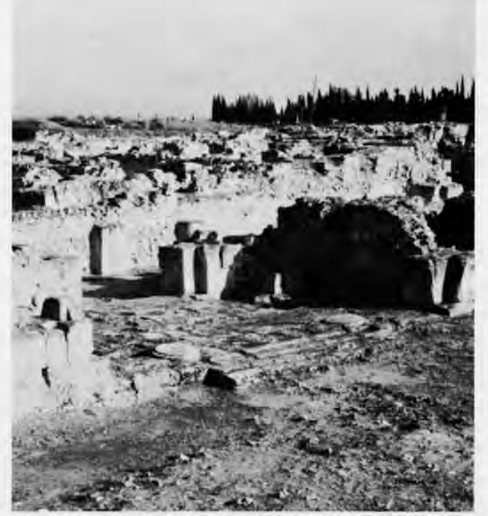
The main entrance to the Late Bronze palace at Ras-Shamra (Ugarit), facing south-east. The first Ugaritic abecedary was found just to the right of the entrance steps.

cal ritual, in one case the exorcising of serpents from Ugarit, while in another case the myth presents the god El in a drunken state then gives a recipe for a cure for alcoholic collapse.