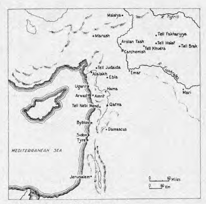
The Major Archaeological Sites of Syria

By the first millennium B.C., Ugaritic and Amorite have disappeared, as nearly as we can determine from the extant