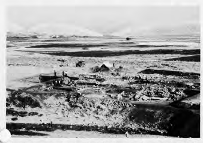
The main area of excavation, looking northward towards the Tauros mountain foothills. The "skull building" foundations lie at the right foreground; the plastered floor of the main room shows its protective white canvas covers.

The single surprise in this generally simple Sears Roebuck catalogue has, from the start, been the appearance of small articles