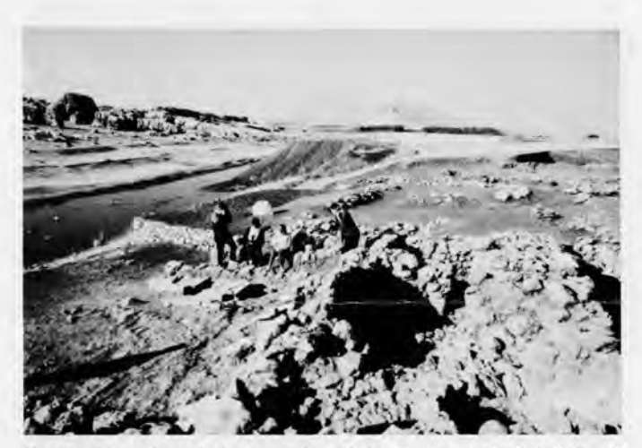
The building foundation remains of the Çayönü "skull building," looking westwards with the Boğaz Çay stream and the Hilar rocks on the right.

Next, in our third (1970) field season, we found the even larger and certainly grander single-roomed remains of a similar building, this time with a fine salmon-colored terrazzo floor, and with interior pilasters, their positions emphasized by pairs of white lines in the terrazzo flooring. In the northwest corner of the