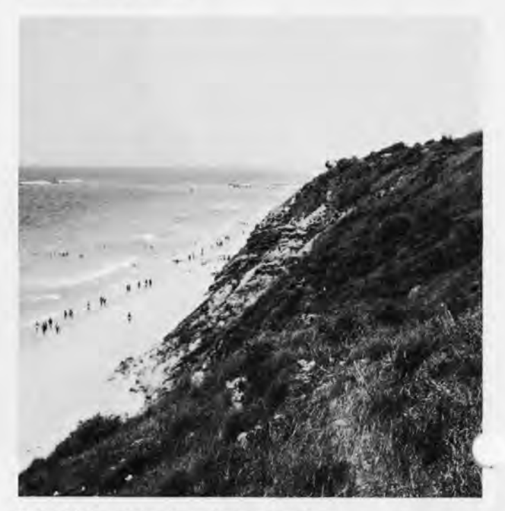
Tel Ashkelon rising above the beach and sea.