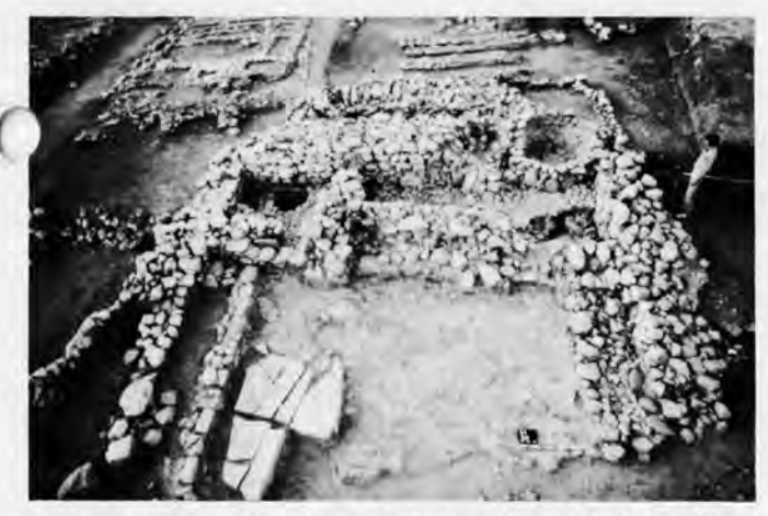
End-of-season plan view of the Çayönü "skull building" foundations. The round stone-lined pit in the right rear is an intrusive storage pit. The original wall-heights would have been of sun-dried brick, over the stone foundations.

and pigs provided the meat for most of the site's duration. Toward the end of the occupation, domesticated sheep (and probably goats) appeared.