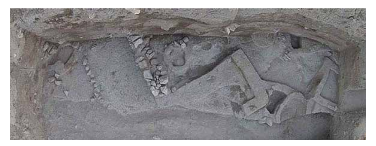
Figure 2. Bronze Age perimeter wall and fourth millennium warren of rooms

season, and then in 2016 (fig. 2) and now continuing into the current 2017 season, Stephanie has shown that at the end of the fourth millennium residents were in the process of moving up the mound, building a literal warren of rooms in which to conduct mostly industrial activities. However, just a few decades or a century before (which she is now excavating in 2017), residents inhabited larger and more spacious spaces, built with better architecture. The types of changes that occurred in the lower town, reported on before in these reports and in other publications, are mirrored in Stephanie's trenches, evident due to her exceedingly careful work.