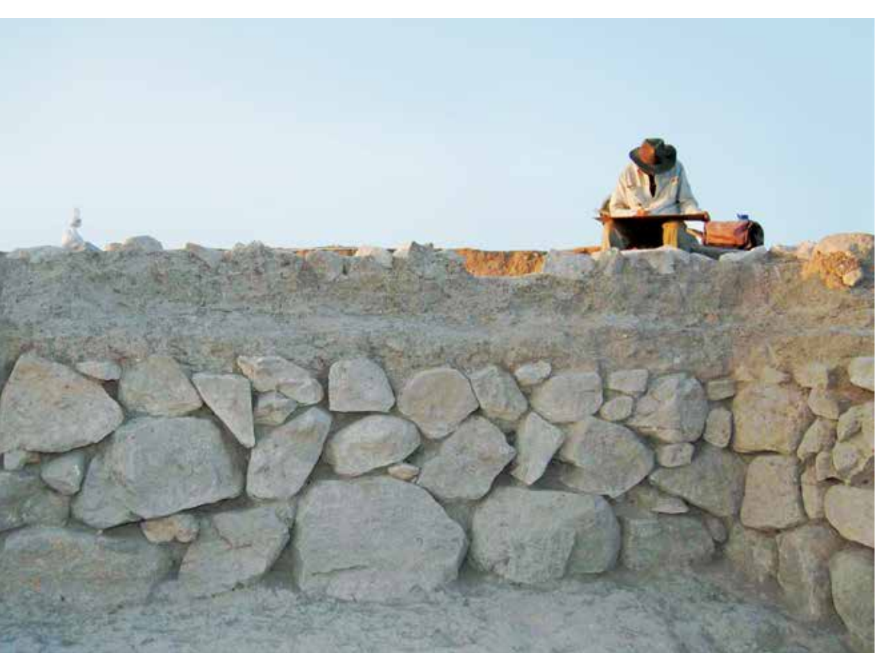
Figure 8. Trench SMT 9, under Tony Lauricella's supervision