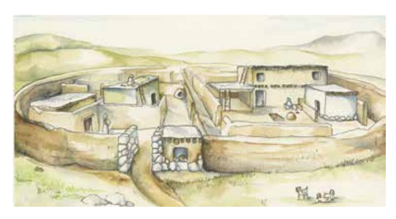
Figure 3. An illustration of what the team believes the site will look like by the end of 2017

In our lower town, in trenches SES 1–2 and LSS 3–5, we continue to define the agglutinated architectural phase reported on last year. This occupation dates to the first half of the fourth millennium. The western area of these trenches is not yet at this earliest agglutinated phase. Burcu Yıldırım, from the American Research Institute in Turkey, is carefully removing the next latest phase, which included a kiln and ceramic working area that were likely installed by the later "Omphalos Building" occupants (dating to the second half of the fourth millennium and reported on in many publications). We hope that by the end of the 2017 campaign all five of the southernmost trenches will be in phase, bringing together Burcu's trenches and those excavated by our other area supervisor, Laurel Hackley, revealing what we believe to