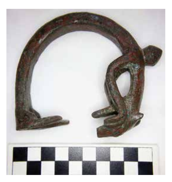
Figure 9. Recovered cat-faced metal artifact