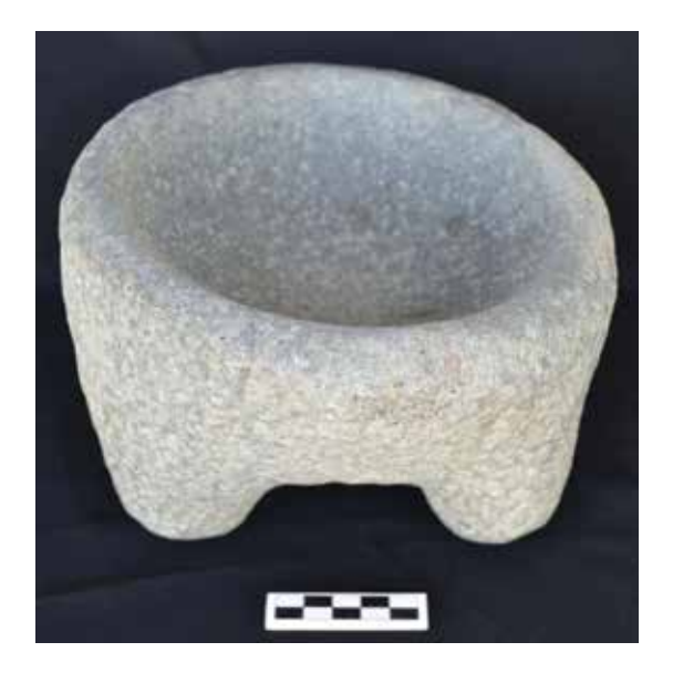
Figure 5. Three-footed stone vessel

building foundation consisting of stones, clay, and what once were wooden posts running through the foundations. This building was fronted by two courtyards (fig. 4). Next to the wall of one of these courtyards was an infant burial, and what appears to have been the dedication of a three-footed stone vessel holding organic remains (fig. 5). Unfortunately, the majority of this building is inside the mound, under meters of later overburden, and it is unlikely that we will be able to uncover it any time soon. Instead, in the present 2017 season, we have chosen to expand northward from this area, in hopes of revealing other areas inside the large Hittite period casemate walls that have been reported on here in past seasons.