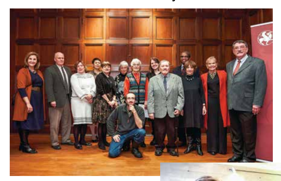
Figure 15. Volunteer recognition