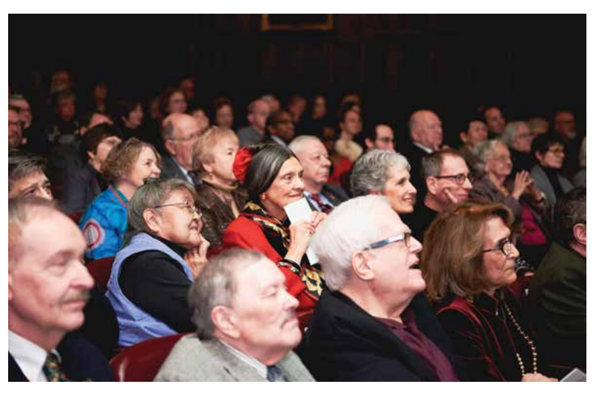
Figure 10. 50<sup>th</sup> Anniversary Celebration was attended by over 200 hundred people, December 4, 2016