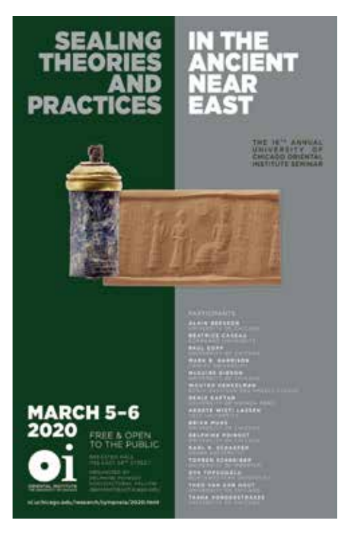
The 2020 postdoctoral seminar poster.

cations also manages the printed material for the postdoctoral seminar, which includes copy editing and designing the program and poster and producing the name badges, informational packets, and miscellanea. The seminar for this last year was titled Sealing Theories and Practices in the Ancient Near East, organized by Delphine Poinsot (program, schedule, speaker abstracts and bios, and other information available here: oi.uchicago.edu/research/symposia/2020. html). Additionally, book proceedings from the seminar will be published. A good amount of time continues to be spent assisting the Chicago Demotic Dictionary (CDD) and the Chicago Hittite Dictionary (CHD) as well.