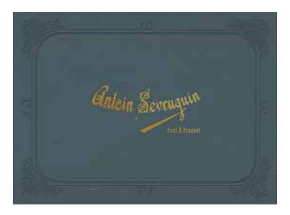
Upcoming Sevruguin publication.