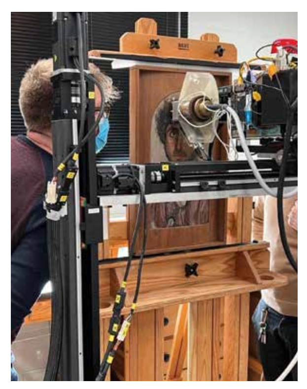
Figure 8. Scientists analyze the surface of a male funerary portrait (OIM E2053) using customized macro X-ray fluorescence equipment to obtain information on the painting's elemental composition.