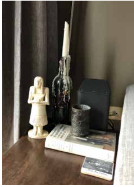
Figure 11. Examples of objects from the Cultural Heritage Experiment in the homes of students.