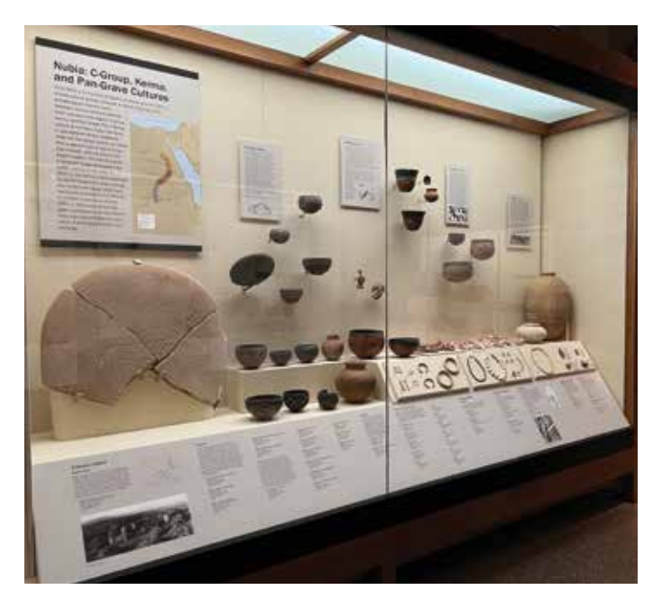
Figure 3. Completed reinstallation of the display case "Nubia: C-Group, Kerma, and Pan-Grave Cultures" in the Nubian gallery.

A final noteworthy endeavor took place in connection with the temporary removal of the Nefermaat