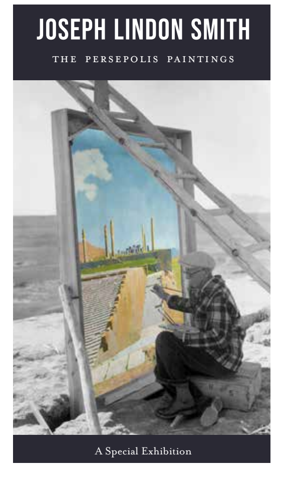
Figure 1. Cover of the gallery handout for the special exhibition Joseph Lindon Smith: The Persepolis Paintings.

Accompanying the paintings in the exhibition is a screen streaming nine minutes of footage of the site of Persepolis during the first years of the expedition (a monumental landscape much like what Smith would have experienced during his visit), excerpted from the OI's 1934 promotional film The Human Adventure . The gallery also includes a display case showcasing archival documents that elaborate on the history of the six-piece collection. Featured are correspondence between Breasted and the team at Persepolis regarding Smith's forthcoming visit; a 1935 issue of The University of Chicago Magazine , on loan from the Hannah Holborn Gray Special Collections Research Center of the University