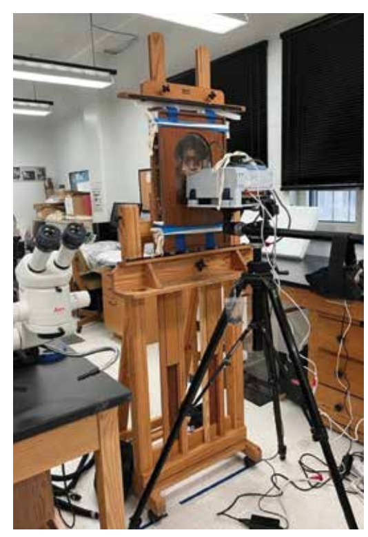
Figure 9. Female funerary portrait undergoing Fourier-transform infrared spectroscopy to aid in identifying materials and pigments.