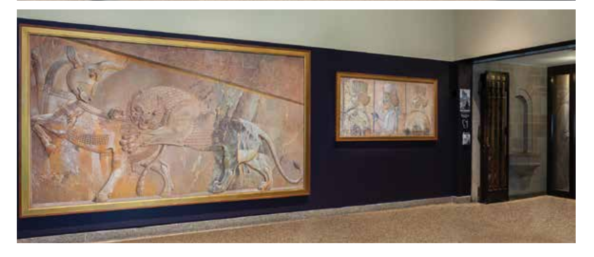
Figure 2. Installation photographs of Joseph Lindon Smith: The Persepolis Paintings.