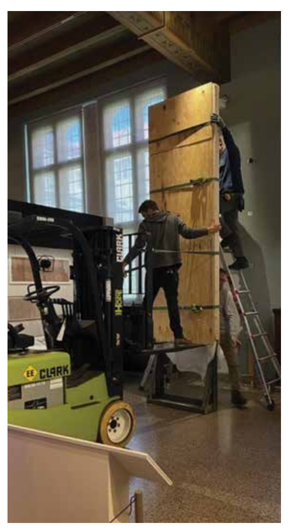
Figure 5. Nefermaat stela protected for its move across the galleries.

which took place in Bologna in April 2021. We look forward to future opportunities to collaborate with our colleagues as this study moves forward.