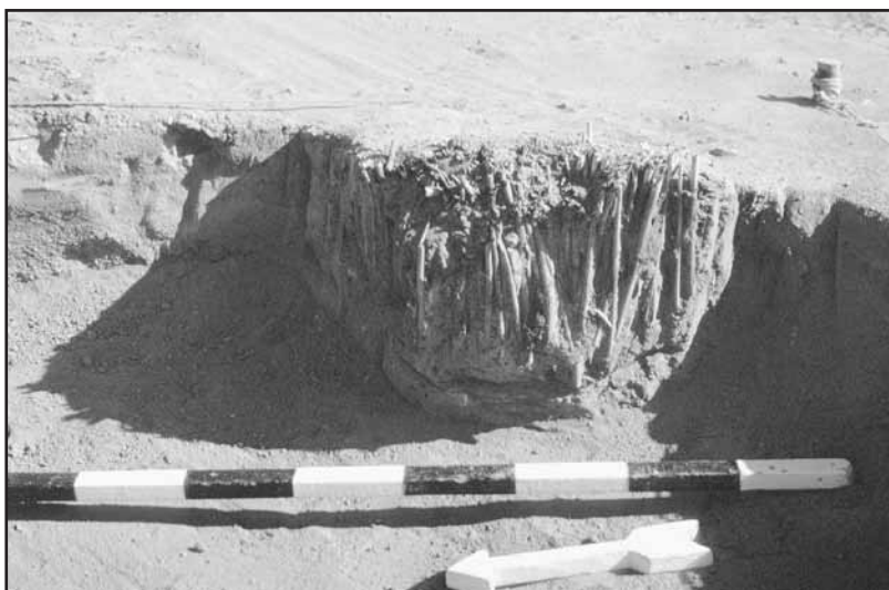
Reeds in the sand. Nippur, Iraq

Within the projected hundred by hundred me-