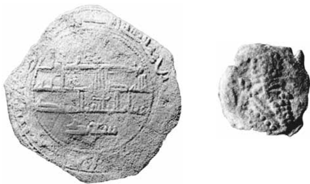
Islamic coin (left) and Sasanian coin (right). Nippur, Iraq. Scale ca. 2:1

To finish the monograph, all that needs to be done is my own report on the digging itself, with the architecture and stratigraphy. I was happy to discover that I have already written a substantial introduction and part of the first chapter, and that the object catalog is done. Now, with the help of