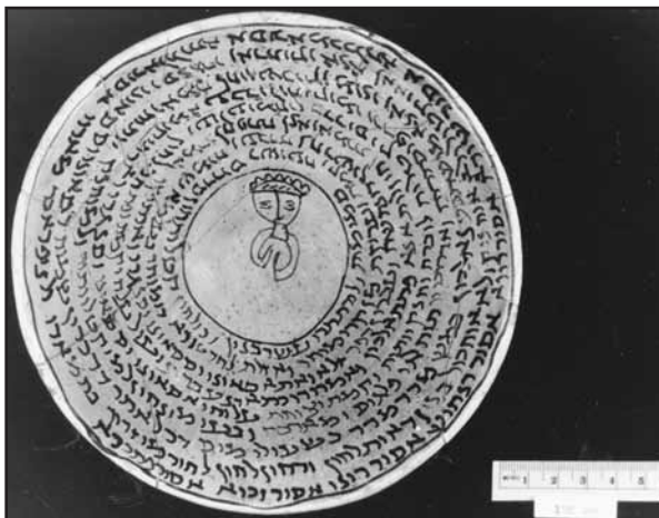
Aramaic incantation bowl. Nippur, Iraq

cially noted for having produced dozens of these bowls, which have in their interiors writing, and sometimes drawings, that are meant to protect a household from evil spirits. Chief among the demons was Lilith, who snatched away children. The drawing, usually in the center of the bowl and often ludicrous, shows a creature in chains. The words are normally written in a spiral, from the outer edge down toward the center, so that it is the prayer, naming the members of the household and even the animals and possessions of the family, that keeps the demon in check. Some of our bowls have a “writing” that is merely scratches with a pen. In these cases, the priest who “wrote”