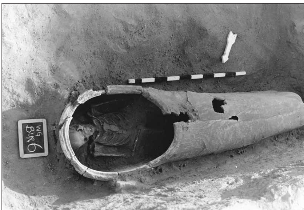
Parthian "slipper" coffin. Nippur, Iraq