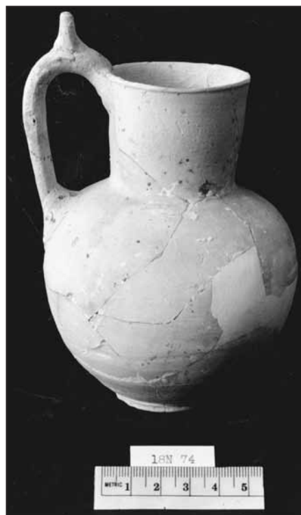
Islamic pitcher. Nippur, Iraq

they were completely covered. When we began digging in WA seven years later, I was surprised not to see the columns, and I became convinced that someone, maybe one of the guards, had taken the bricks to use in the repair of a house. But, now, here was the Court of Columns once again. Although the dune had moved off the Court of Columns, it still lay over most of WA, deeper down. Being a deep hole, the sand tended to lodge there, and the winds that had taken the rest of the dunes from the site would only occasionally dip down into WA and remove sand. But enough of the sand had been removed from the entire area to show that Pennsylvania's previous work and a gully or two furnished us with a space of about a hundred meters by a hundred meters in which to work. If we could dig this entire area systematically, level by level, we would be able to show not only how the temple changed through time but also its relationship with its immediate surroundings. We had been able to expose a few rooms of the temple in a number of periods in previous seasons and knew already that there were remains of six re-buildings stacked on one another. These versions of the temple, from the top one down, were datable to the sixth century