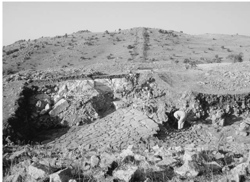
Figure 4. 2004 excavation area in the palace gateway