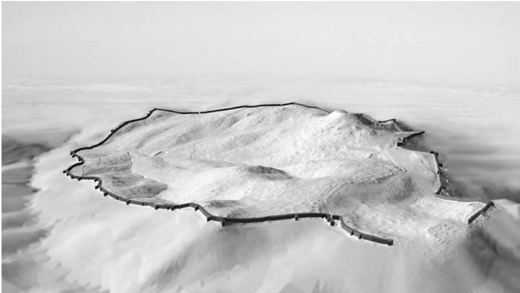
Figure 1. Virtual reality reconstruction of Kerkenes Dağ based on GPS survey data

city that the remote sensing showed had structures that looked like megarons, a building style with parallels to the west in Phrygian areas of Anatolia. We excavated precisely one half of one of these structures and were able to confirm that they were in fact megarons, providing important clues as to who some of the urban inhabitants were.