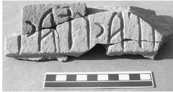
Figure 3. Small portion of Old Phrygian inscription from palace gateway with joining fragments recovered in 2003 and 2004

Beyond the Palace, excavations also took place along three of the streets of this ancient city. This new initiative is an outgrowth of my own research entailing simulations of ancient pedestrians moving around within the urban fabric of the city. Just as modern city planners use tools such as this with virtual automobiles to determine where to site new roads or new shopping malls or industries, I have been working with ways to