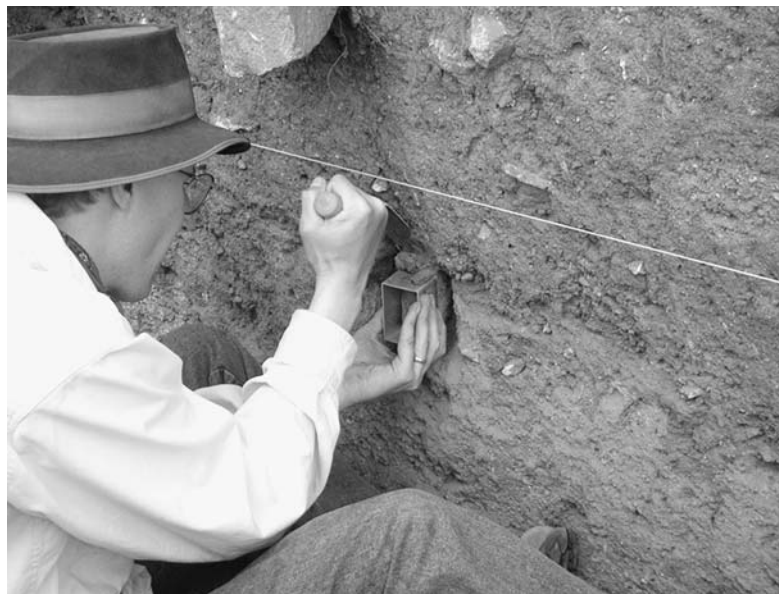
Figure 8. Taking a micromorphology sample from a buried street at Kerkenes Dağ

hustle and bustle of people moving around and which were the quiet back streets or even alleys (fig. 7). The excavations we undertook this year were designed to test these simulations of virtual pedestrians against traces of ancient walking over these streets in the past, especially looking at different amounts of compaction of the dirt street surfaces as more and more people once walked over them. Excavations cut through three different streets: the predicted main street of the city, a side