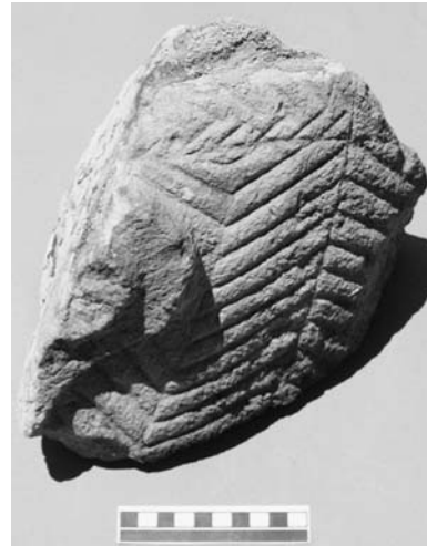
Figure 6. Fragment of a large statue of a sphinx

use them in order to understand how an ancient city was used by its inhabitants. Using only models of how different people walk and the form of the street network itself we have been able to predict which streets, and which urban blocks on them, were the main streets filled with the