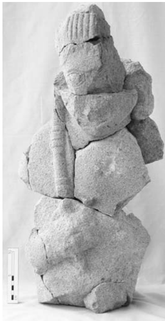
Figure 5. Upper half of 1 m high statue of a human figure from palace gateway