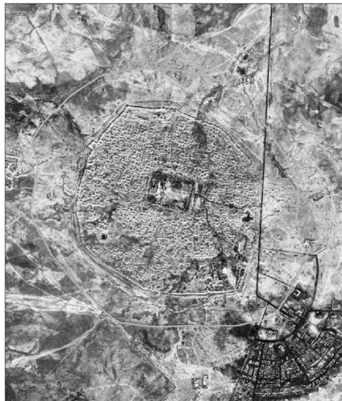
Hatra Core Area

Compiled by the Global Heritage Fund Mapping Team 2005