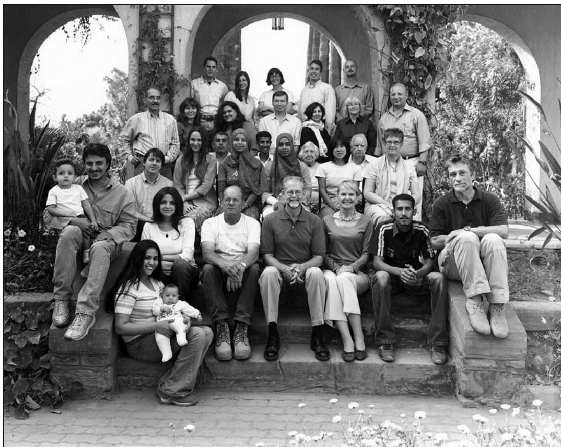
Chicago House staff, 2006/2007