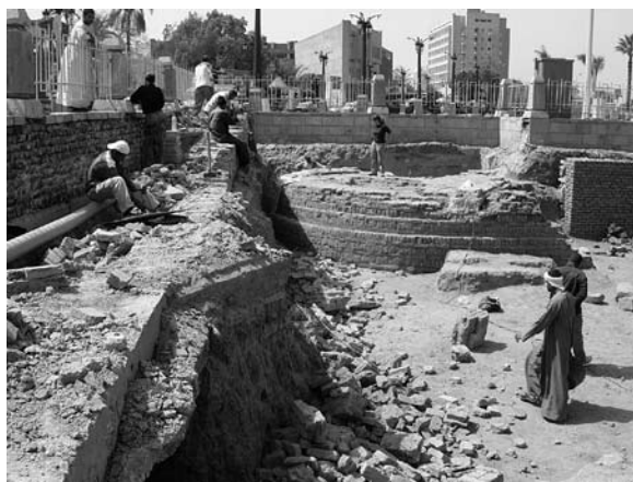
Demolition of the eastern garden wall to expose Roman bastions.

around the Roman precinct, and 550 from the medieval foundations around the bastion). The material from the medieval foundation around the north bastion is mostly broken up sphinxes from the four-kilometer Sphinx Road linking Karnak and Luxor Temples, and Nectanebo II portal blocks. All these fragments appear to be reconstructible and are being given separate "ET," "Eastern Tetrastyle," numbers. Stay tuned for future analysis and reconstruction!