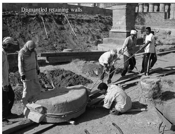
Moving fragmentary material from the east Roman gate area into the Luxor Temple blockyard.

permanent signage is being designed, and a brochure will be written for the general public. The museum will also include displays showing artistic techniques, conservation methods, and ancient sculptures and marks an exciting, educational phase of our operations in the blockyard.