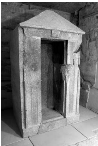
Restored naos back in position.