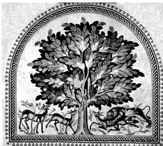
Figure 2. Floor mosaic from Mafjar, showing the tree of life with gazelles and a lion