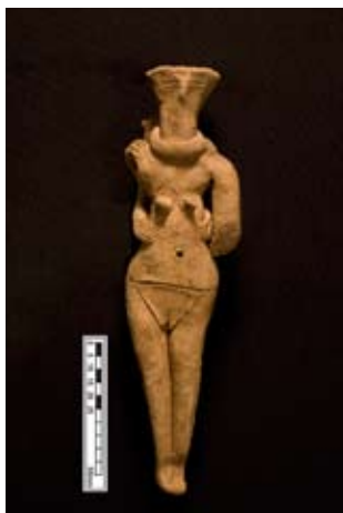
Figure 8. Clay fertility figurine found inside the silo demolition layer

388 is still preserved to a height of more than 3 m above floor level, and the curvature of the dome is easily visible, yet very fragile. This silo seems to have also been previously excavated, probably by the French in the 1920s or 1930s because it was filled with excavation debris.