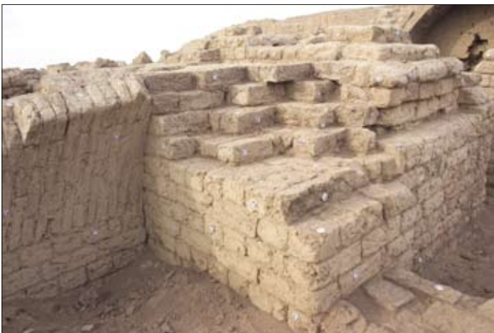
Figure 14. Lower part of a Ptolemaic house showing reference markers used for 3-D modeling

that was excavated by the Franco-Polish mission in the 1930s and is still preserved in excellent condition (fig. 14). One of the challenges was to find the best possible reference markers, which are used for the automatic alignment of photographs to create a 3-D photo skeleton for extracting point-cloud data. In the field the local conditions such as strong sunlight created inevitable shadows, and the winds and the occasional roaming of wild dogs provided quite a few challenges. Another study sample was the female fertility figurine with the baby on her back. The processing of this data and the final generation of the 3-D models are currently in progress. Two other