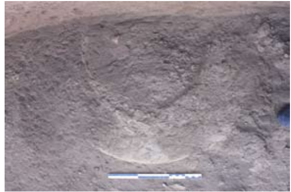
Figure 12. Negative imprint of an octagonal column visible on a column base

The majority are scarab seals showing the typical decorative spiral motifs of the late Middle Kingdom; however, a few have personal names and titles. In 2007 we discovered several seal impressions showing the figure of a king wearing the crown of Upper and Lower Egypt with a tiny cartouche in front of his face that can be read as “Nimaatre,” which is the throne name of Amenemhat III (see News & Notes 198).