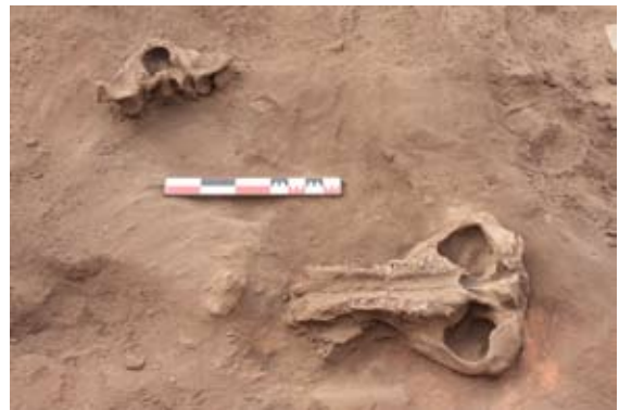
Figure 3. Hippopotamus upper skull and vertebra discovered near the silos

A large quantity of animal bones was also excavated this year. Of particular note are the bones of several hippopotami. An entire upper skull (fig. 3) has been discovered in the area immediately east of Silos 405 and 303. Additionally, multiple pieces of jawbones, tusks, vertebrae, and leg bones have been found in different contexts in the silo area, some in the debris layers of the New Kingdom, others in earlier fill layers near the silos. The exact reason for them being deposited here and the puzzling fact that there is more than one occasion of dumping hippo bones are questions that we need to answer in the future.