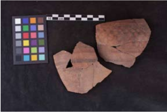
Figure 11. Pieces of Levantine Painted Ware jug found in the columned hall abandonment layer