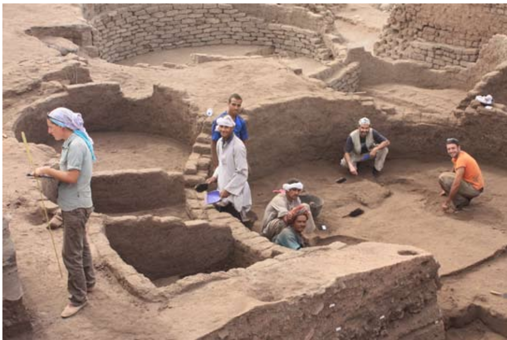
Figure 6. Excavation in progress inside Silo 303