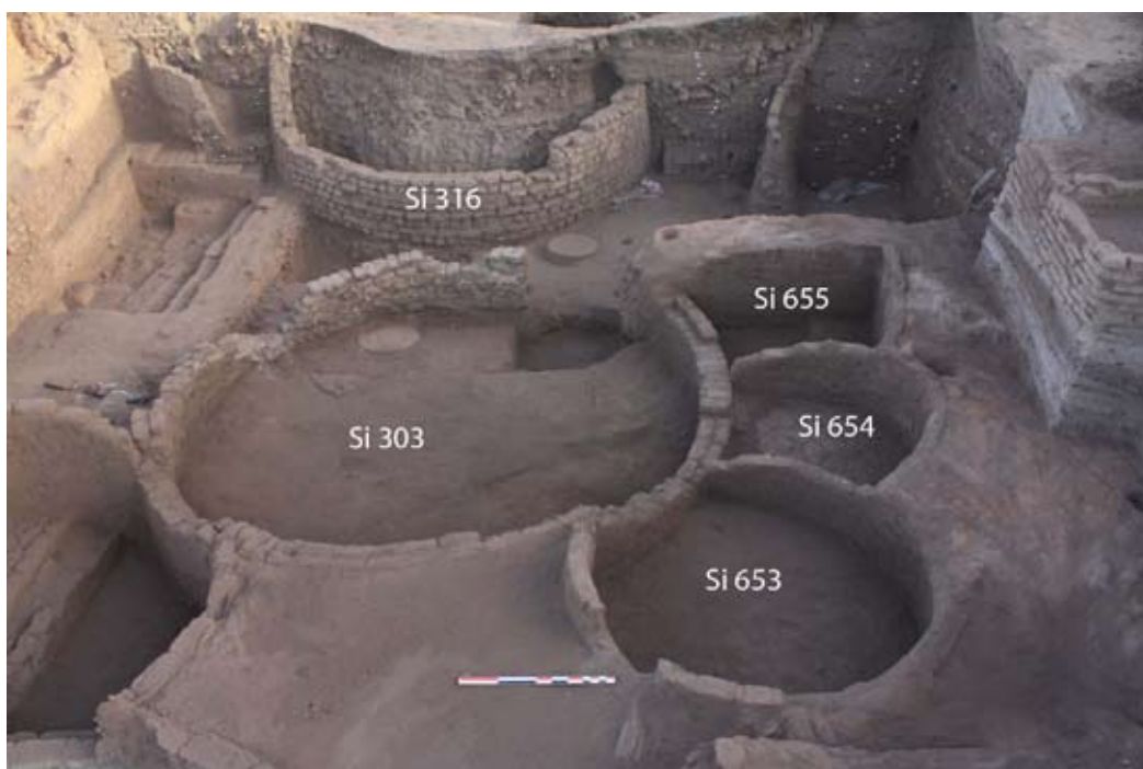
Figure 7. Silos 653, 654, and 655 built against the exterior of Silo 303