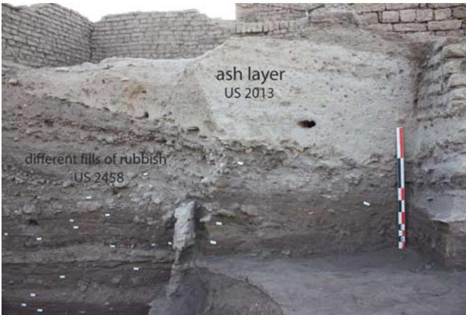
Figure 2. Refuse layers of the New Kingdom

reliable archaeological contexts are extremely rare, especially for the period in question.