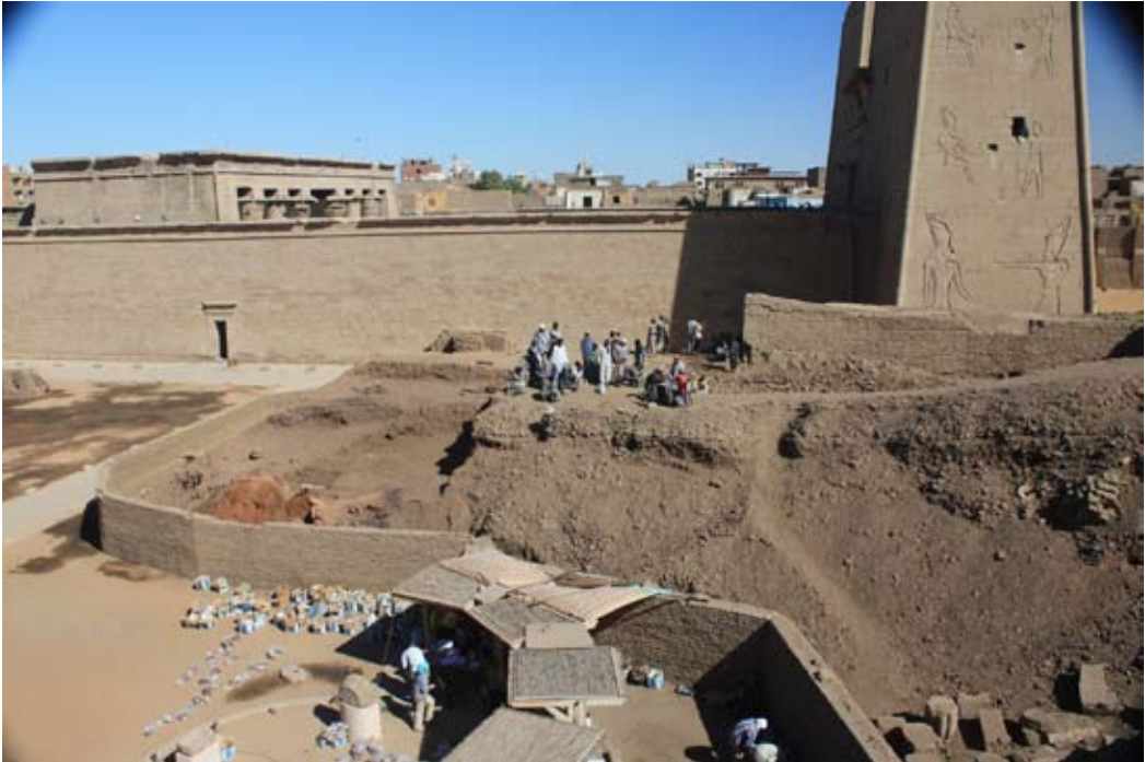
Figure 13. Work in progress during preparation of new excavation area

that was excavated by the Franco-Polish mission in the 1930s and is still preserved in excellent condition (fig. 14). One of the challenges was to find the best possible reference markers, which are used for the automatic alignment of photographs to create a 3-D photo skeleton for extracting point-cloud data. In the field the local conditions such as strong sunlight created inevitable shadows, and the winds and the occasional roaming of wild dogs provided quite a few challenges. Another study sample was the female fertility figurine with the baby on her back. The processing of this data and the final generation of the 3-D models are currently in progress. Two other