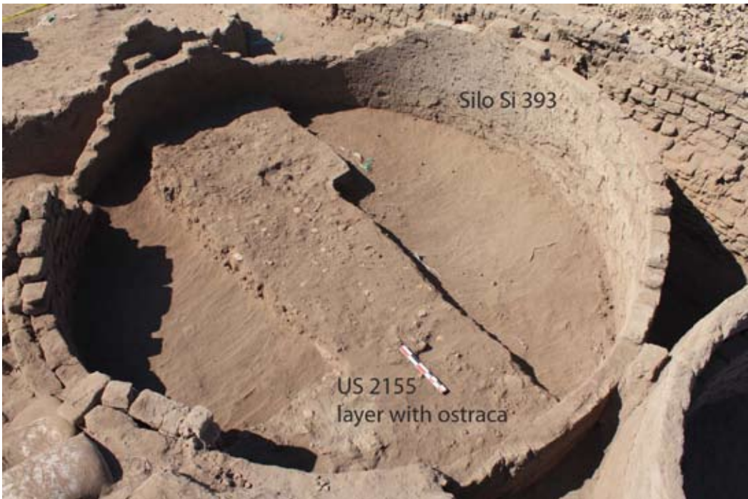
Figure 5. Layer with hieratic ostraca inside silo Si 393

to those found in the northern part of the site (layer US 2458) according to their paleography, suggesting that these pieces come from the same source and period, probably belonging to an archive that was discarded when the administrative buildings in this area were abandoned. Among the ostraca three shallow red bowls were found, broken into multiple pieces, which have been inscribed on the inside and outside in hieratic. These texts will be part of a detailed study by Kathryn Bandy (graduate student in the Department of Near Eastern Languages and Civilizations at the University of Chicago).