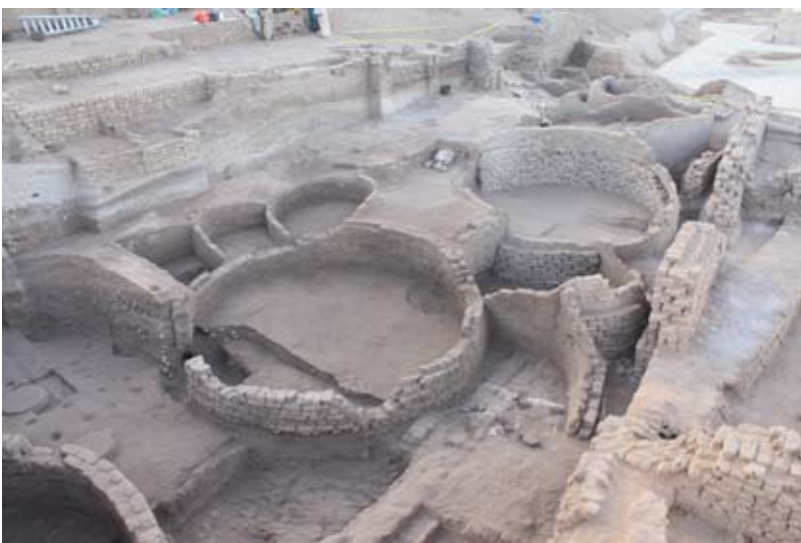
Figure 1. Tell Edfu excavation area in 2009

Last season, we received eagerly awaited official permission from the Supreme Council of Antiquities (SCA) to fully excavate and remove the walls that were built into the thick ash layer covering our excavation area (fig. 1). These walls lay above the granaries and were excavated in 1923. A photograph taken in 1928 from the top of the temple pylon clearly shows the ash layer and the small square silos that were built into it. A comparison with photos taken from the