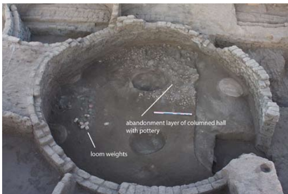
Figure 10. Abandonment layer of the columned hall

On and above the floor of the columned hall we also found numerous seal impressions indicating the opening and sealing of various commodities (boxes, baskets, letters) in this area.