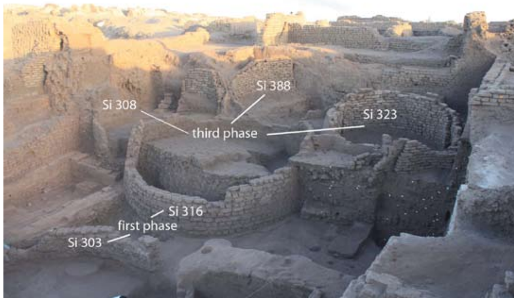
Figure 9. Silos in the northern part of the excavation area

Silo 388 could well be contemporary with the construction of the eastern Silo 323 and/or Silo 313. We cannot establish a precise relative chronology just yet since we are still missing some stratigraphic links in this area, which will be brought to light in excavation next season. Thus the floor of Silo 388 had not been reached by the end of this season, and it is one of the aims for 2010. This silo had been built at a time when the grain storage area was restructured. The main visible transformation was a considerable reduction of the size of the grain silos. In fact, in the north a 2.2 m high wall running east–west was constructed, reducing the extension of the silo court toward the north. A part of another silo wall can be seen that was integrated into this wall. This shows us not only that in its original layout the granary courtyard stretched farther in that direction but also that the latter silo could well have been contemporary to Silo 316 and Silo 303 since it shares identical architectural features.