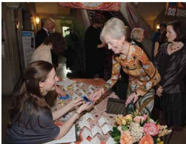
Guest check in and receive their BidPals to participate in the silent auction