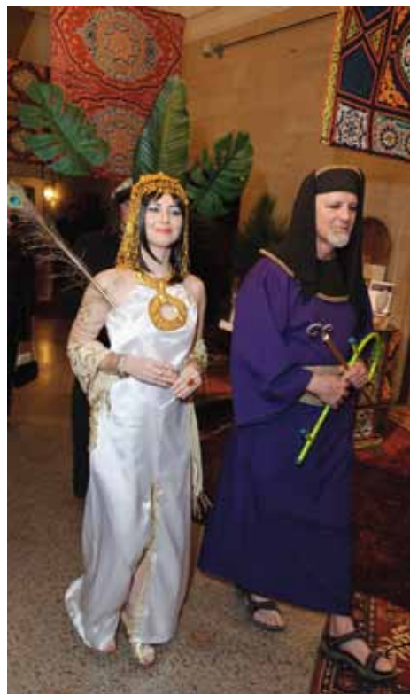
Caterers and performers wearing Egyptian costumes and headdresses entertained guests with dancing, juggling, and music