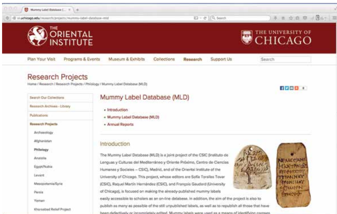
Figure 3. The new homepage of the Oriental Institute website dedicated to the Mummy Label Database