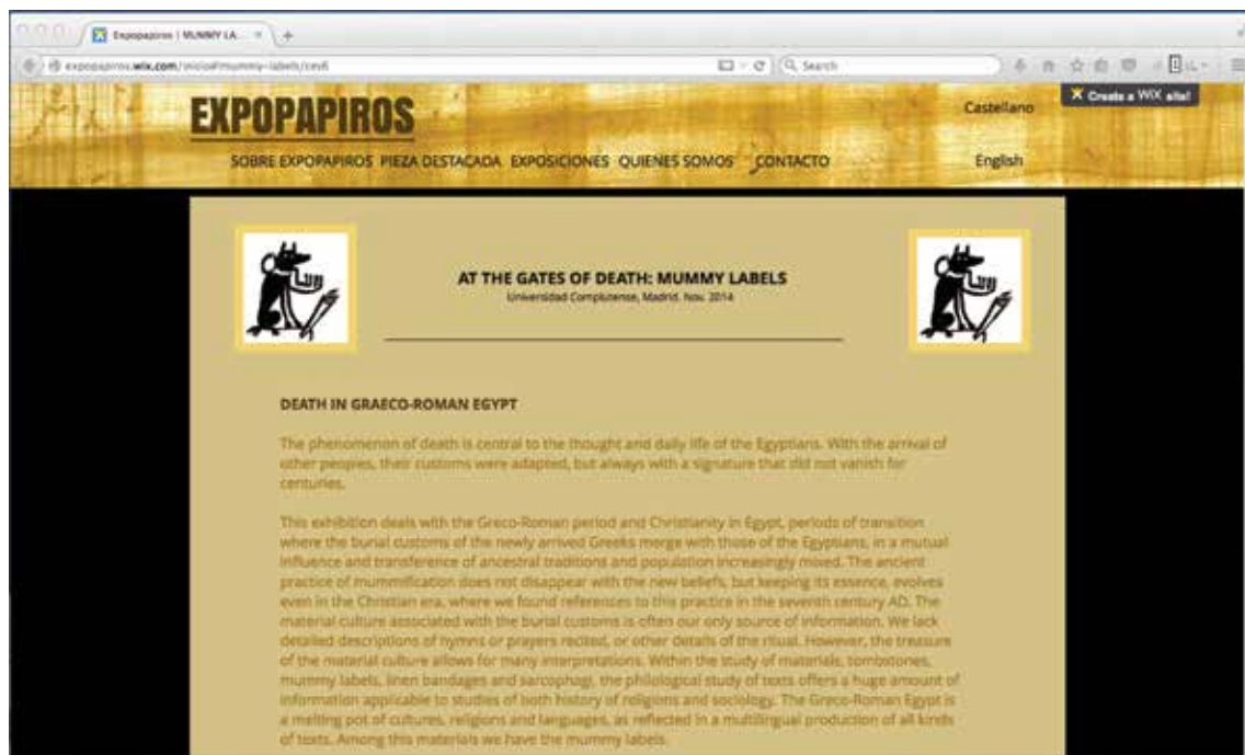
Figure 4. Homepage of the virtual exhibition “At the Gates of Death: Mummy Labels”

http://expopapiros.wix.com/inicio#!mummy-labels/cev6