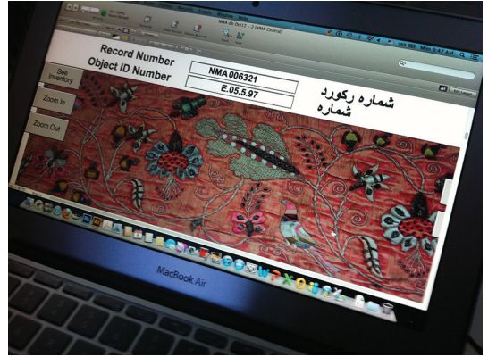
Figure 5. Screen shot showing the digital image of one of the textiles in the National Museum's ethnographic collection entered into a bilingual inventory record

jects and in re-housing them in archival-quality boxes as part of the inventory process. Laura also asked what kinds of conservation-related information they would like to see included in the database. OI Chief Curator Jack Green organized a workshop for the National Museum staff to discuss the value of databases in collections management, and the ways in which the database we are developing might be especially useful for the needs of the National Museum.