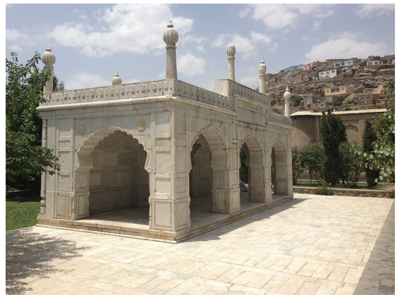
Figure 14. Bagh-i-Babur: restored small royal mosque constructed in the Garden by Shah Jahan, the fifth Mughal emperor. Shah Jahan is best known as the builder of the Taj Mahal