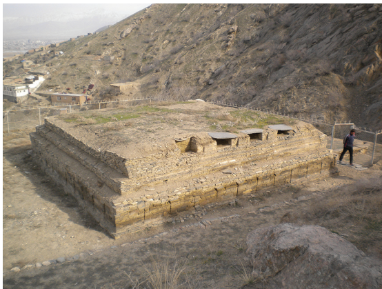
Figure 9. Buddhist stupa at the site of Tepe Narinj on the outskirts of Kabul. Archaeologists from the Afghan Institute of Archaeology excavated and stabilized the architectural remains and constructed a protective fence around the site