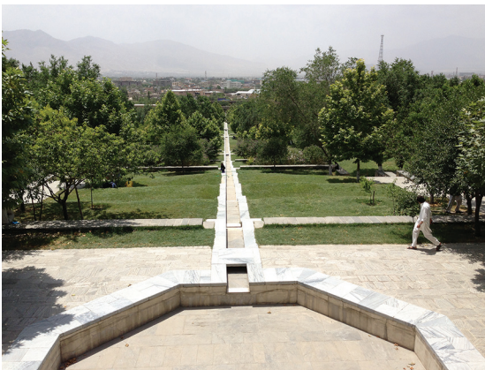
Figure 13. Bagh-i-Babur (Gardens of Babur) in the heart of Kabul, constructed in the sixteenth century by Babur, the founder of the Mughal dynasty. Restoration of Babur’s Garden was funded and carried out by the Aga Khan Trust for Culture (AKTC)