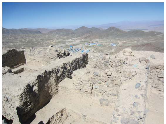
Figure 8. View of the salvage excavations in the upper town of Mes Aynak in Logar province, Afghanistan. The compound of the mining camp is visible in the background. An international team of archaeologists is racing the clock to complete rescue excavations in the core of Mes Aynak before large-scale mining operations begin