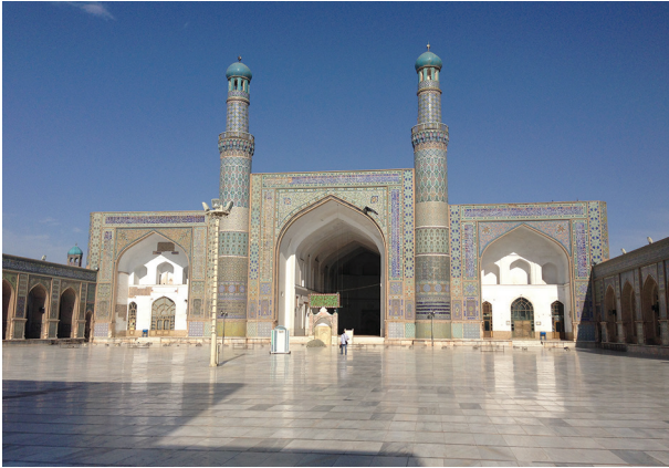
Figure 11. The fourteenth-century Timurid Masjid-i-Jami (Friday Mosque) in the city of Herat, northwest Afghanistan – considered one of the most important surviving Islamic monuments in Central Asia. Note Steve Camp in front of the central iwan for scale. Local civil and religious authorities in Herat have supported the long-term restoration of the magnificent glazed tile work that covers the mosque