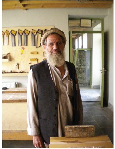
Figure 17. Master woodworker at the Turquoise Mountain Foundation, in a restored traditional house compound in the Old City of Kabul. Turquoise Mountain supports the revitalization of traditional Afghan crafts such as woodworking inlay, gem cutting, ceramics, and jewelry making. These are key elements of Afghanistan's "intangible heritage"

This is only a sampling of the different heritage protection programs that are being implemented with great success in Afghanistan. The main point is that despite extremely difficult conditions, committed efforts like the ones mentioned above are taking place at all, and they are actually succeeding. We are proud that the Oriental Institute's partnership with the National Museum forms a part of this set of initiatives. From everything we have seen over the past year, we are more hopeful than ever that Afghanistan can preserve its heritage as the cultural core for the country's future; we are honored to be able to help in this endeavor.