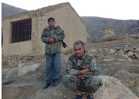
Figure 10. Afghan site guards at Tepe Narinj, standing in front of the barred storeroom constructed at the site by the Afghan Institute of Archaeology to protect the large-scale sculpture and other architectural ornaments

Located in Logar province, about 45 km southwest of Kabul, Mes Aynak was an enormous 1,000-hectare Buddhist city, trade entrepôt, and monastic center that flourished especially in the third to seventh centuries AD. The name “Mes Aynak” means “Copper Spring,” and the site is located on top of what may be the world’s largest known copper deposit. This was the source of the wealth of the ancient city, and it is the source of the threat to its future. The difficult balance between economic development and heritage preservation means that there is only a limited window of opportunity to excavate and document the artistic and architectural treasures of Mes Aynak before it is largely destroyed by modern copper mining activities (fig. 8). Former Deputy Minister for Information and Culture Mr. Omar Sultan has been working extensively with Philippe Marquis of the French Archaeological Mission in Afghanistan and an international excavation team to explore much of the urban core of Mes Aynak and the string of Buddhist monasteries that surround it. Some of the finest sculpture and other artifacts from Mes Aynak are now on display in the National Museum.