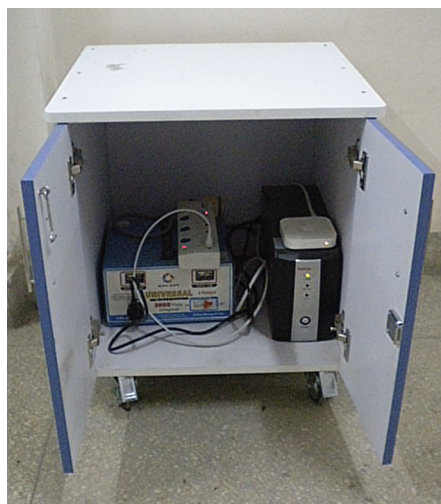
Figure 3. Router extender in a cabinet on wheels – our two “rolling routers” enable the Kabul team to extend our wireless network to reach every gallery and storeroom in the National Museum so that we can carry out the data entry for the museum inventory