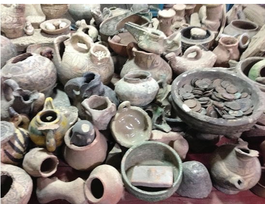
Figure 7. Looted artifacts along with modern fakes on sale in the Herat bazaar. Extensive looting of sites across Afghanistan continues to be a major threat to Afghan cultural heritage

Perhaps the most important of these efforts is the large-scale collaboration between Afghanistan and the international community to conduct rescue excavations at Mes Aynak.