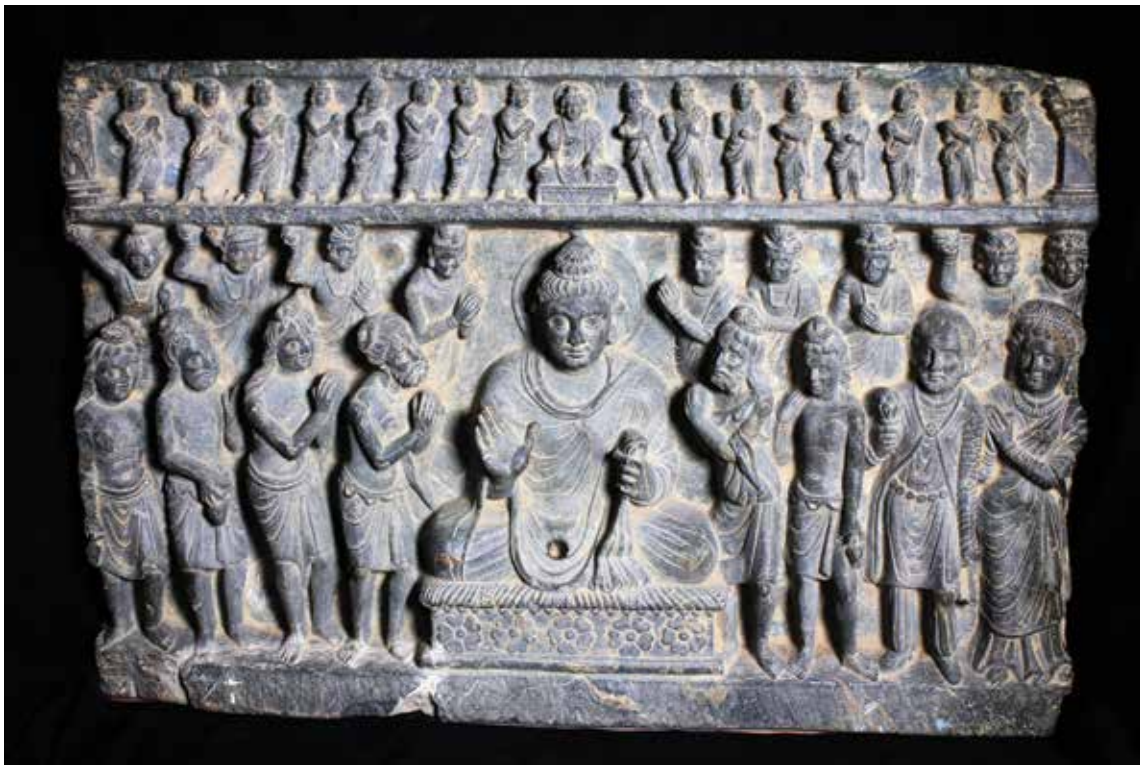
Figure 4. The Kashyapa Brothers relief — an important example of early Gandharan art from the Buddhist monastery site of Shotorak. This relief, looted from Afghanistan, was part of a shipment of 100 looted objects repatriated from Japan back to the National Museum in Kabul in 2016

Shotorak — most notably the famous Kashyapa Brothers Relief, one of the treasures of early Gandharan Buddhist art (fig. 4). After conservation, the repatriated collection was the focus of a beautiful special exhibit at the National Museum.