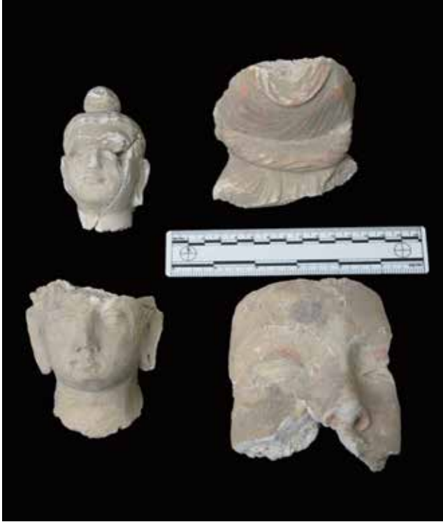
Figure 6. Hadda sculptural fragments with preserved external surfaces depicting heads and clothing; the high proportion of external fragments will greatly aid in the restoration process

formed from a range of materials — stucco, limestone, and occasionally schist. We estimate that the fragments originated from a minimum of 100–200 sculptures. The initial sample suggests that a large proportion of these pieces are fragments of the exterior of the sculptures, preserving details such as facial features, limbs, and clothing (fig. 6). This means that the chances for reassembling the sculptures will be quite good. Fabio and Alison were able to locate a number of exterior surface fragments that preserved the museum registration numbers written on them. Sadly, the actual paper registration records that would describe these objects were burned in the attacks on the National Museum during the Afghan Civil War (when an estimated 90% of the Museum’s registration records were destroyed). We are continuing the assessment phase of the project; on that basis in the coming year we will develop a detailed plan for the conservation and restoration of the Hadda sculptures.