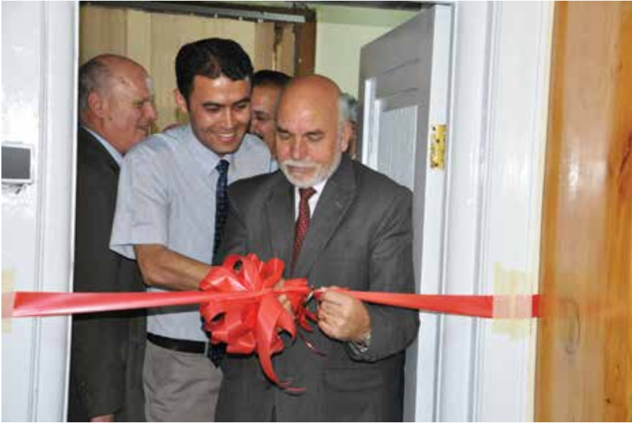
Figure 9. Afghan Institute of Archaeology (AIA) Director Noor Agha Noori and Minister of Information and Culture Bawari cutting the ribbon to open the library/data archive at the AIA

worked with AIA Director Noor Agha Noori to renovate and equip a Geographic Information Systems (GIS) Laboratory with six work stations at the AIA, and have also renovated the AIA library so it can serve as a suitable data archive for the geospatial and archaeological data generated by our project (fig. 9).