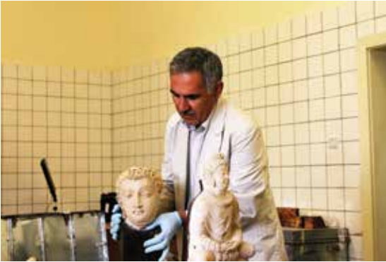
Figure 2. Gandharan style early Buddhist sculptures from Hadda in the Presidential Palace vaults